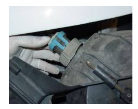
Step 8: Unplug the headlight bulb from the housing.