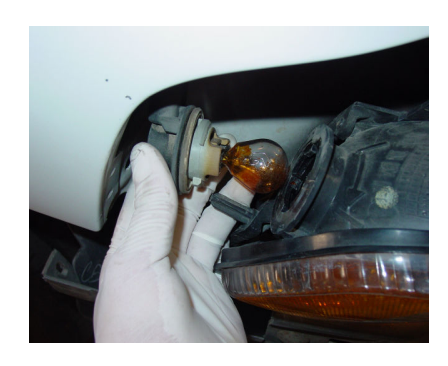
Step 11: Plug in the corner light.