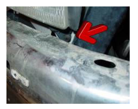
Step 6: Remove the third screw from the bottom headlight.