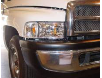
Step 12: Bolt on the headlight and check all functions before driving.