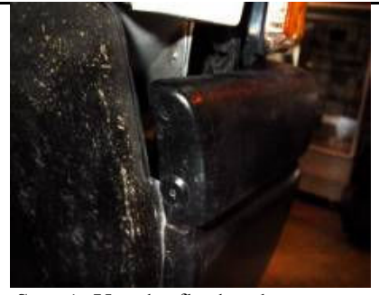
Step 1: Use the flat head screwdriver to remove the pin holding in the place bumper