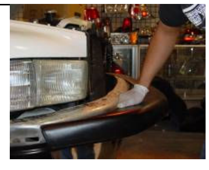
Step 2: Remove the plastic bumper guard.