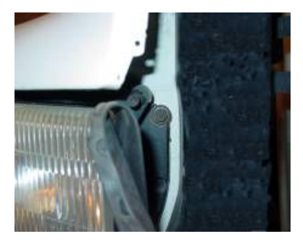
Step 4: Remove the top 10mm screw holding in the headlight.