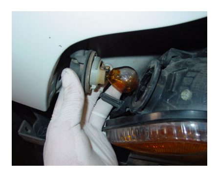
Step 7: Twist off the corner light from the headlight.