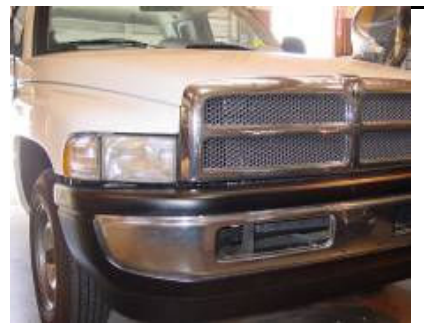
Tools needed. 10mm socket, flat head screwdriver.