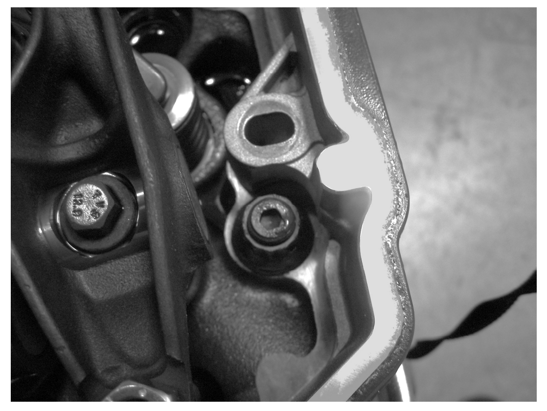
Finished machine work should allow easy removal and installation of the head stud.