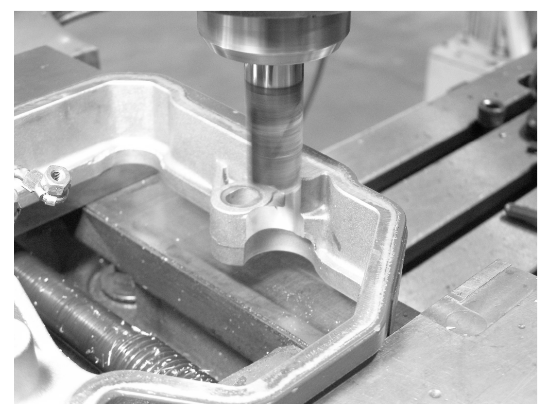
Remove material as necessary to allow clearance for the stud, nut and washer.

Note: It will be necessary to machine the lower rocker arm cover at the No. 24 bolt hole location in the torque sequence to facilitate installation of the lower rocker arm cover (see illustrations).