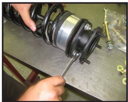
Repeat steps 19 - 25 on the passenger side.

26. Locate (6) 38NLN and (6) 516WA from hardware bag torque to 95 ftlbs. 34106NB. Working on the driver side, install the strut assembly back into the vehicle using the new 3/8" nuts and 5/16" washers on the top mounting point, and the OE hardware on the lower mounting position. Do not tighten hardware at this time. Repeat on Passenger side.