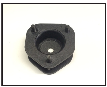
32902-01 / Qty. 2 Upper strut spacer