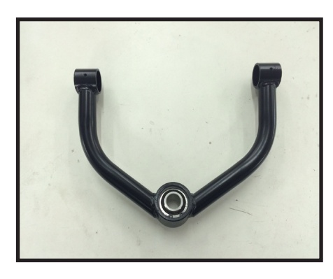
34106-02 / Qty. 1 Passenger side upper control arm