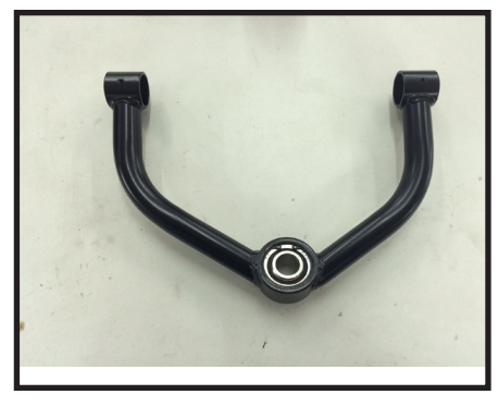
34106-01 / Qty. 1 Driver side upper control arm