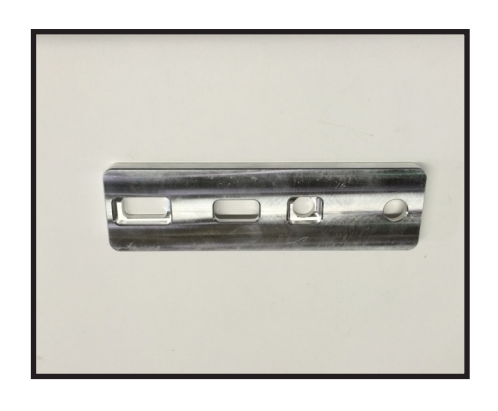
54060-08 / Qty. 2 Sway bar drop brackets