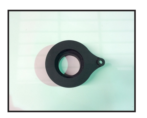
34105-03 / Qty. 2 Rear coil spacer