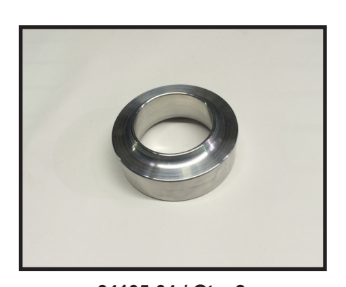
34105-04 / Qty. 2 Strut pre load spacer