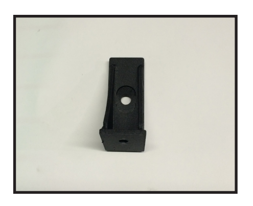
32102-01 / Qty. 2 Bump stop bracket