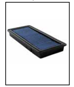
P/N: 30-10202 (P5R) 31-10202 (PDS) 72-10202 (PG7)