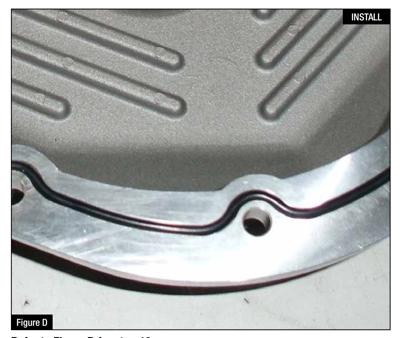
Refer to Figure D for step 12

Step 12: Lightly coat the supplied O-ring with oil and install onto the aFe differential cover.