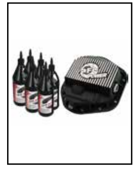
P/N: 46-70082 (Black) 46-70082-WL (w/ 0il) 46-70080 (RAW)