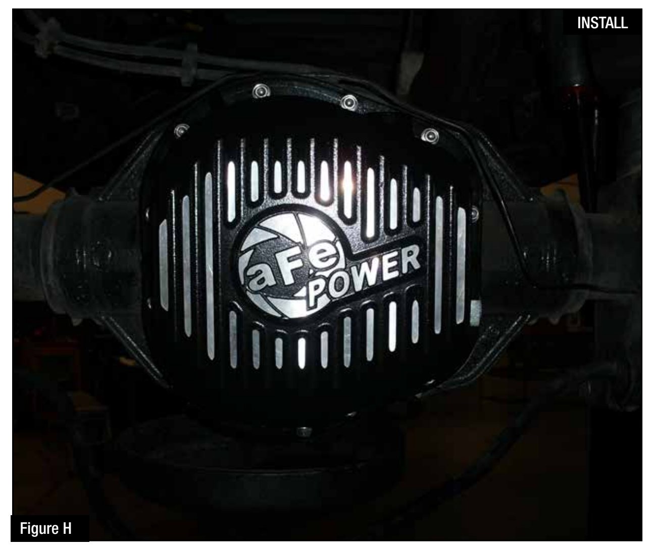
Refer to Figure H for step 18

Step 18: Your installation is now complete.