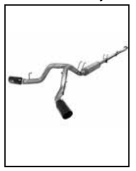
P/N: 49-43066-B (Blk Tips) 49-43066-P (Pol Tips)