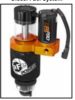
P/N: 42-13041 (Full Time) 42-13042 (Boost)