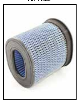
PRO 10R P/N: 20-91061 PRO DRY S P/N: 21-91061 PRO GUARD 7 P/N: 72-91061