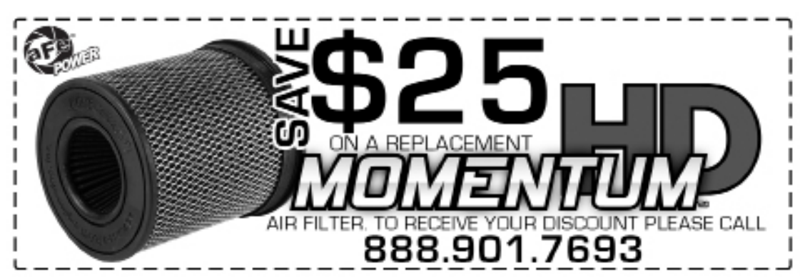
To purchase any of the items above, view airflow charts, dyno graphs, photos, and video; please go to aFepower.com.