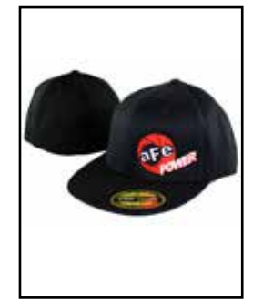
P/N: 40-10114 (S/M) P/N: 40-10115 (L/XL)