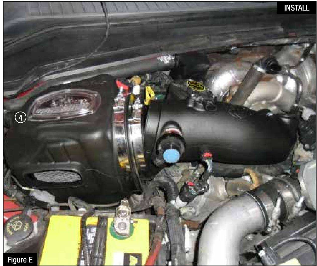
Refer to Figure E for steps 14-15

Step 14: Connect the Momentum HD tube to the turbo. Leave the tube at a 45-degree angle.