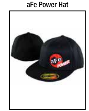
P/N: 40-10114 (S/M) P/N: 40-10115 (L/XL)