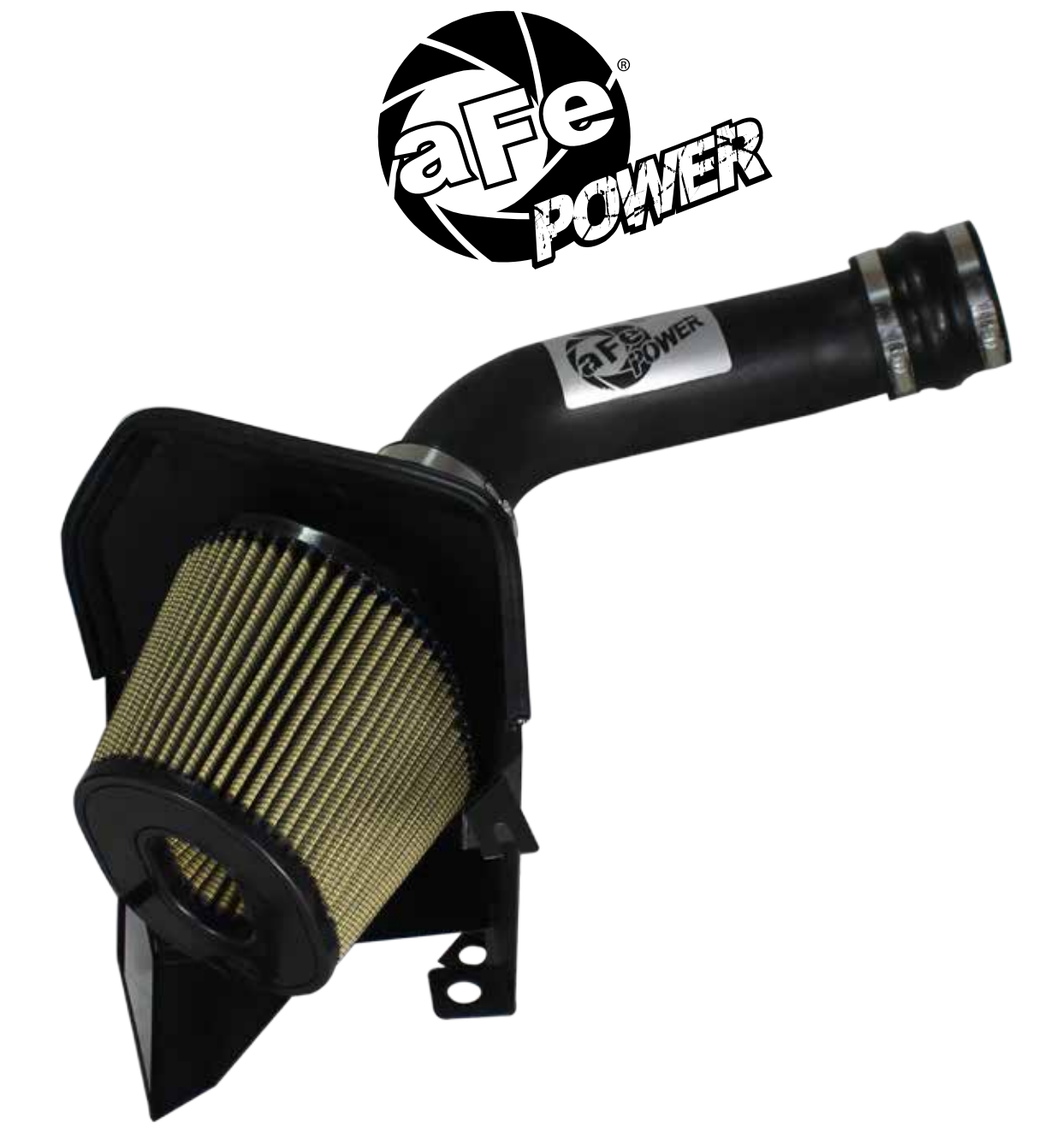
advanced FLOW engineering Instruction Manual P/N: 51-12472 / 54-12472 / 75-12472

Make: Jeep Model: Grand Cherokee (WK2) Year: 2014-2016 Engine: V6-3.0L (td) EcoDiesel