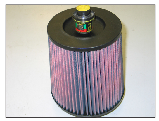
25. Install the grommet and filter minder removed in step 24 into the K\&N^{\textcircled{R}} air filter as shown. On vehicles not equipped with filter minder install the provided plug.