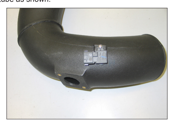
28. Install the air temperature sensor into the grommet and then secure the sensor with the provided bolt and spacer.