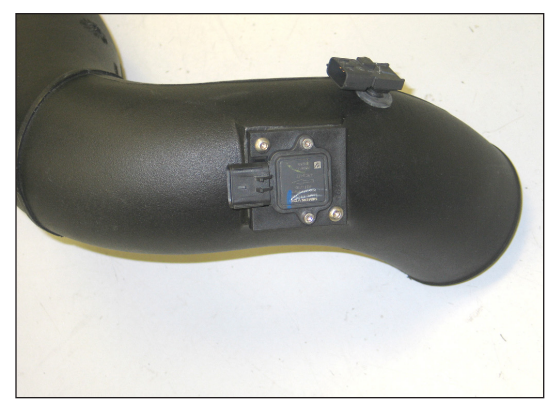
31. Install the mass air sensor assembly into the intake tube and secure with the provided hardware. NOTE: The arrow on the top of the mass air sensor should be pointed in the direction of the intake air flow, towards the turbo inlet.