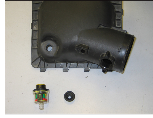
24. On vehicles equipped with filter minder, remove filter minder and grommet from the upper air box as shown.