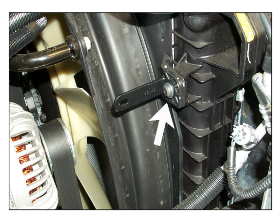
15. Remove the radiator fan shroud bolt. Then install the heat shield mounting bracket (07158) onto the fan shroud using the provided hardware as shown.