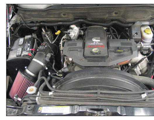
36. Reconnect the vehicles negative battery cable. Double check to make sure everything is tight and properly positioned before starting the vehicle.