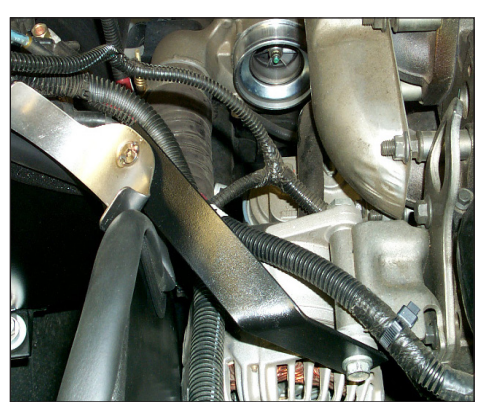
14. Install the tube mounting bracket assembly onto the alternator and secure with the factory bolt removed in the previous step.