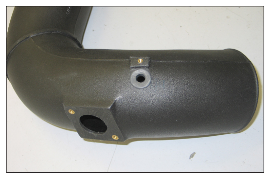
27. Install the provided grommet into the intake tube as shown.

NOTE: Plastic NPT fittings are easy to cross thread. Install the vent fitting "hand" tight, then turn it two complete turns with a wrench.