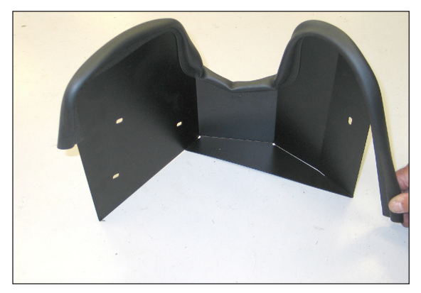
17. Install the provided edge trim onto the heat shield as shown.

NOTE: Some trimming of the edge trim will be necessary.