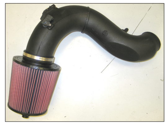
32. Install the K&N<sup>®</sup> Air Filter onto the intake tube and secure with the provided hose clamp. NOTE: The filter is a tight fit, be sure the tube bead seats into the receiver groove in the filter.