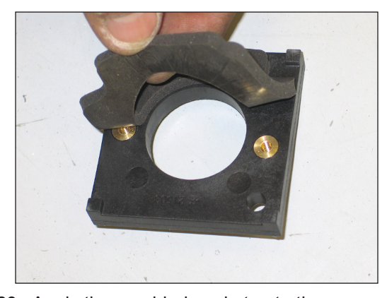
29. Apply the provided gasket onto the mass air sensor adapter as shown.