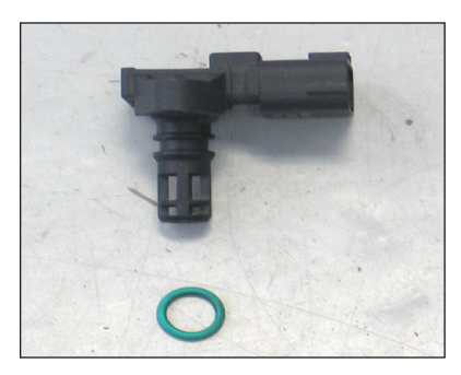
23. Remove the "O" ring from the air temperature sensor.