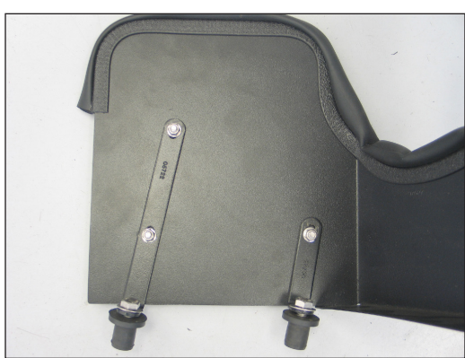
20. Attach the two provided inserted nuts to the heat shield using the provided hardware as shown. NOTE: Do note tighten the mounting bolts at this time.

NOTE: The bolts should be inserted from the back side through the heat shield and then through the bracket.