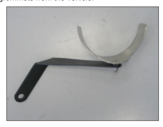
12. Install the supplied saddle clamp onto the tube mounting bracket (07160) using the provided hardware as shown.