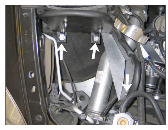
21. Install the heat shield assembly into the engine compartment as shown. The inserted nuts should be positioned into the air box mounting grommet holes and align the front mounting hole in the heat shield with bracket installed in step #15. Secure the heat shield with the provided hardware and the two inserted nuts.