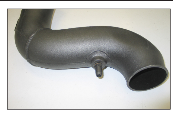
26. Install the provided ¼"npt fitting into the intake tube as shown.

NOTE: Plastic NPT fittings are easy to cross thread. Install the vent fitting "hand" tight, then turn it two complete turns with a wrench.