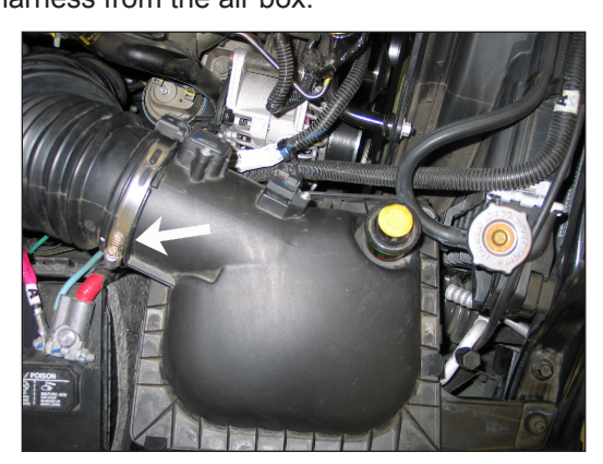
4. Loosen the hose clamp which secures the stock intake tube to the upper air box housing.

3. Disconnect the inlet air temperature sensor electrical connection and then unhook the wiring harness from the air box.