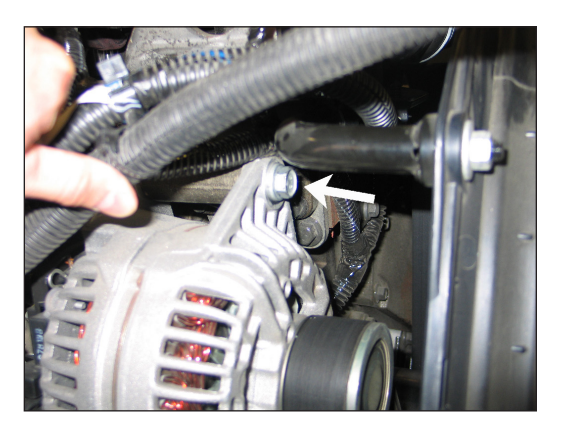
13. Remove the upper alternator mounting bolt shown.