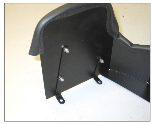
19. Install the provided heat shield mounting bracket (06722) onto the heat shield using the provided hardware.

NOTE: The bolts should be inserted from the back side through the heat shield and then through the bracket.