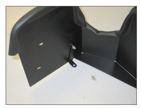
18. Install the heat shield mounting bracket (06723) onto the heat shield using the provided hardware. NOTE: The bolt should be inserted from the back side through the heat shield and then through the bracket.

NOTE: Some trimming of the edge trim will be necessary.