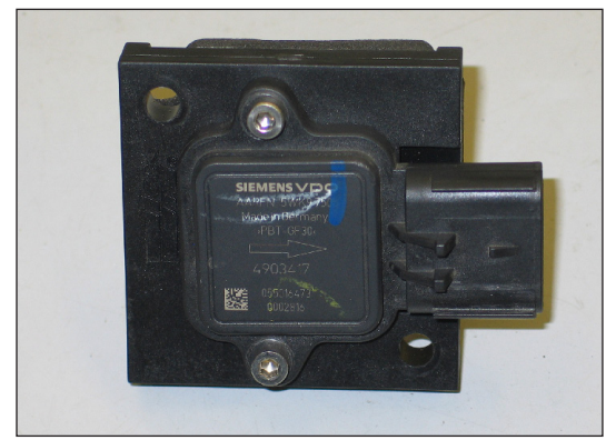
30. Install the mass air sensor into the adapter and secure with the provided hardware.