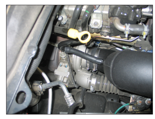
34. Install the provided air injection hose onto the air injection tube and then connect the open end to the 1/4"npt fitting in the K&N ^{\circledR} intake tube.