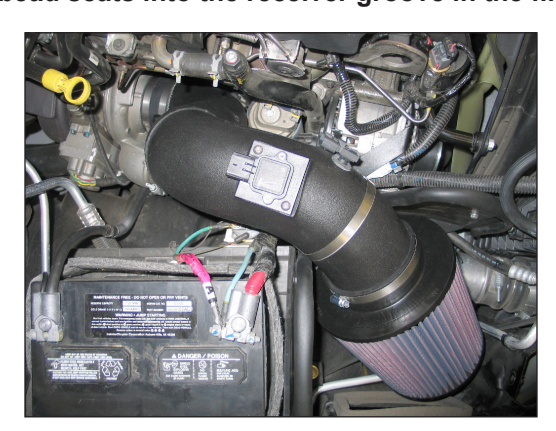
33. Install the intake tube and filter assembly, slide the intake tube into the silicone hose at the turbo and then align with the saddle bracket. Secure the assembly with the provided hose clamps.