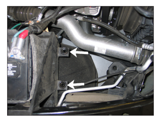
11. Remove the two lower air box mounting grommets from the vehicle.