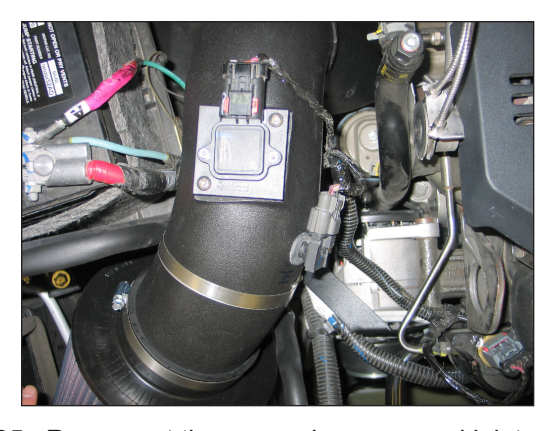
35. Reconnect the mass air sensor and inlet air temperature sensor electrical connections.