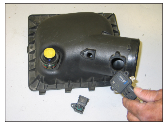
22. Remove the screws which secure the mass air sensor and inlet air temperature sensor and then remove the sensors as shown.