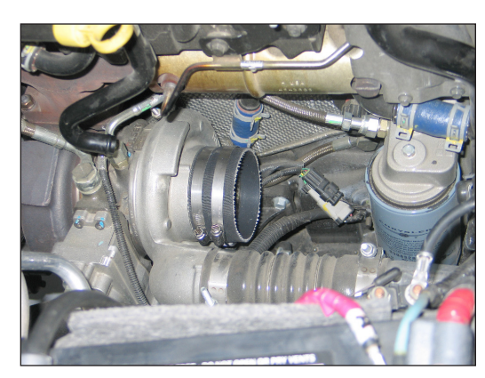
16. Install the provided silicone hose (08761) onto the turbo and secure with the provided hose clamp.