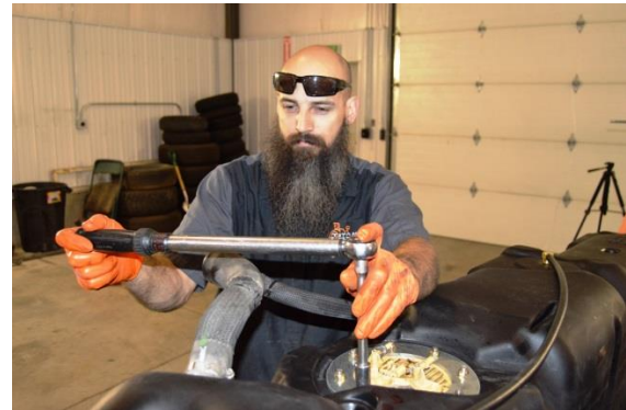
(Fig. 3) Place the sending unit into the TITAN tank, install the top flange, and tighten the nylon lock nuts to 20 ft. lbs using a “star” pattern using a torque wrench.