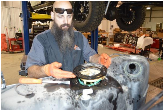
(Fig. 2) Loosen the hold-down ring on the OEM tank by turning counter-clockwise. Note where the connections on your vehicle’s sending unit are “clocked” and install so they are located in the same position in the new tank.