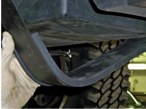
(Fig. 4) Install rubber bushings (pn 99 0000 0103) on both straps with the channel side toward the strap.