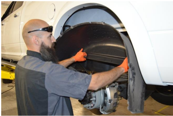
(Fig. 1) Some vehicles may require the removal of the fender liner and perhaps the left rear wheel so as to facilitate access to the tank fill and vent hoses.