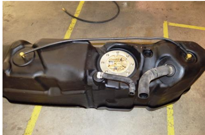
(Fig. 5) Photo shows the fill and main vent hoses transferred and installed on new TITAN tank. Note the 5/16" hose between the two rollover valves. The small line from the vehicle's fill spout will attach to the tee in this line. The tab on the sending unit lines up with the "TAB LOCATOR" marks on the tank body.