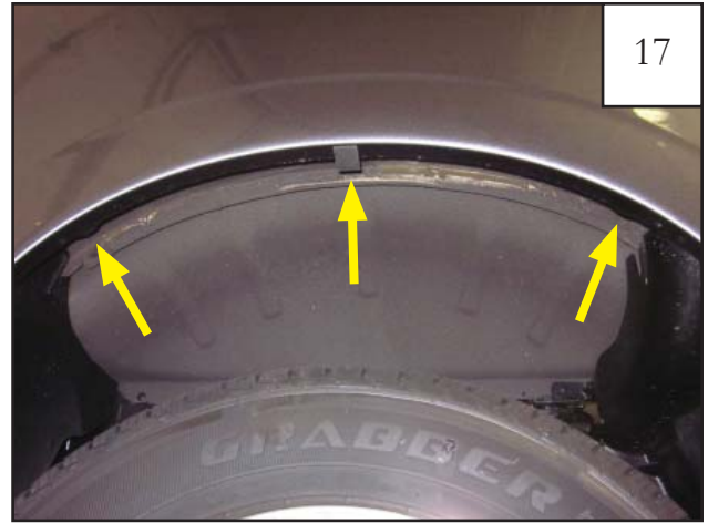
17 Install a foam tab (MT1-0034) over 3 top center metal tabs in the wheel well