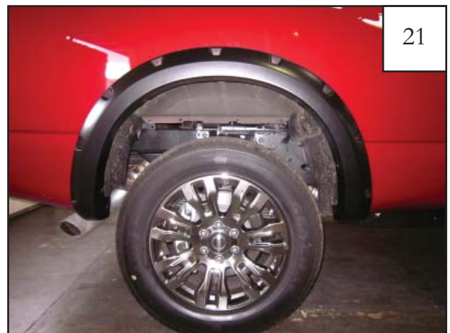
21 Installation complete.