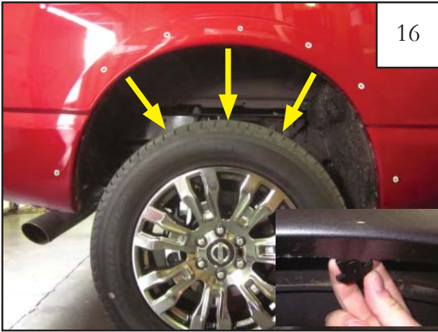
16 After removing the Factory flare, remove 3 factory installed clips.