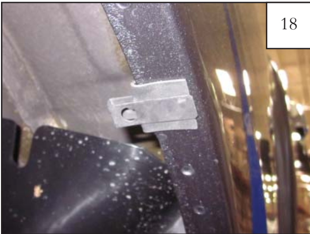
18 Install supplied long clips (CL1-0009) over the foam tabs.