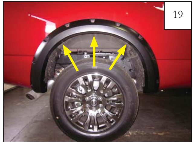
19 Position flare on rear fender and install 3 supplied screws (SW1-0058) through flare and into the clip holes.