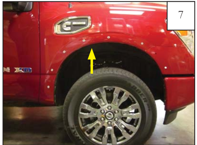
Using a #2 Phillips Screwdriver, remove factory screw from wheel well.