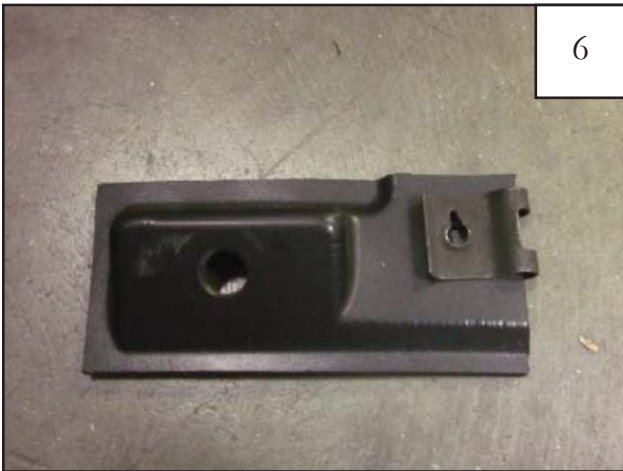
Install supplied clip (CL1-0022) on end of inner bracket.