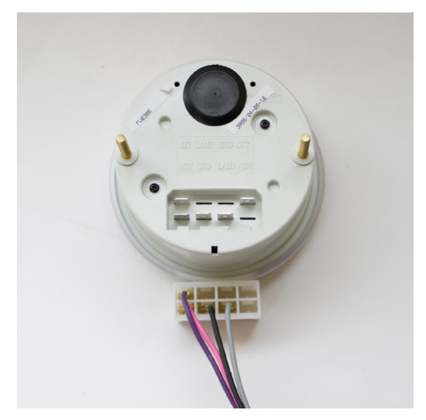
Electric Speedo with lower row terminals