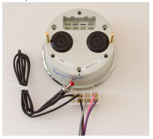
Contact Auto Meter Tech Support for the proper terminals for your calibration button if you have this design.