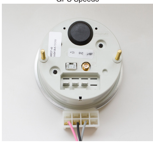
You may remove or simply not connect the purple wire when using a GPS Speedometer. Electric Speedometers that use an interface module still require the purple wire.