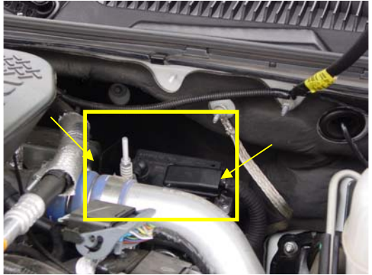
1. View Glow Plug Controller mounted on Driver Side Firewall. Remove 2 bolts holding the controller case cover.