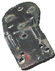
Lift Pump Bracket