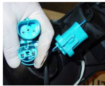
Connect the high beam and low beam plugs, check connectors for proper install.