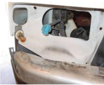
Step 9: Remove the headlight from the car.