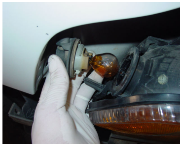
Step 14: Plug in the corner light.