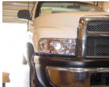
Step 15: Bolt on the headlight and check all functions before driving.