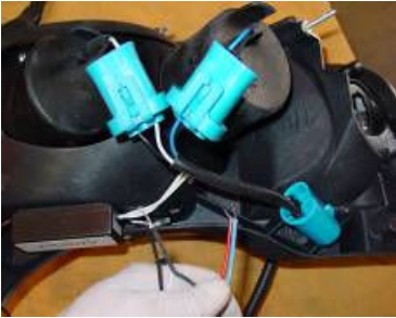
Step 11: Connect the red and blue wires together and black with black for halos and led.