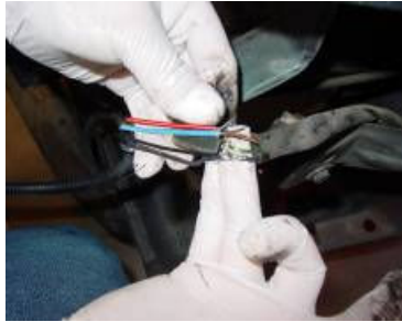
Step 12: Splice the red/blue wire with the power (brown) and black with the black on the corners