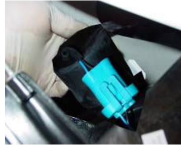
Step 13: Plug the headlight wire harness into the original headlight harness.