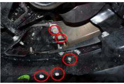
Step 9: Get under the vehicle under the bumper cover to remove the five 10mm screws.