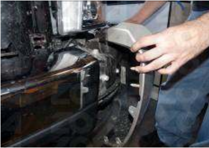
Step 12: Pull off the bumper cover from the frame of the vehicle.