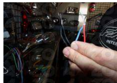
Step 19: Twist the red and blue wires together and the two blacks together from the new headlight.