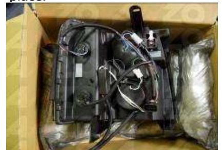
Step 17: Take out the new Anzo headlight from the box.