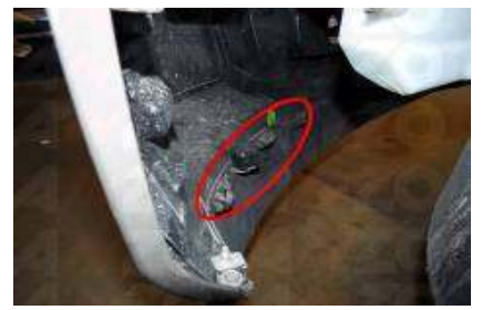
Step 11: Unclip the three pins holding in the bumper cover and the lip.