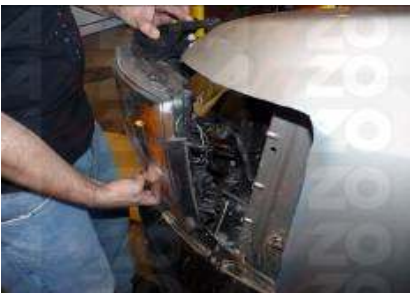
Step 15: Remove the headlight from the vehicle.