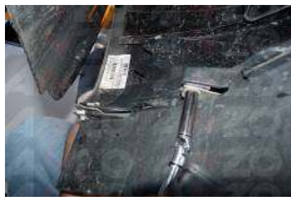
Step 10: Remove the 10mm screw holding in the lip to the bumper cover.