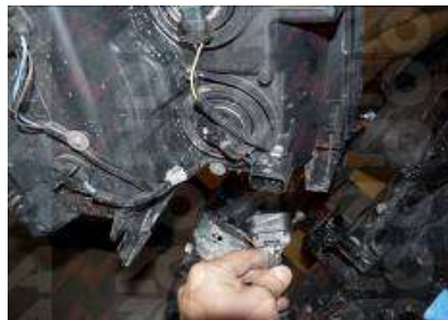
Step 16: Unplug the wire harness from the headlight.