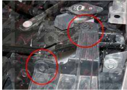
Step 13: Remove the two 10mm screws holding the headlight in place.