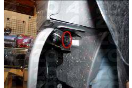
Step 14: Pull back the wheel well cover to remove the 10mm socket holding the headlight in place.