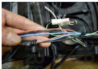
Step 18: Locate the 2 light tan and black wire from the Anzo headlight does not matter which ones you use.