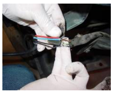
Step 12: Splice the red/blue wire with the power(brown)and black with the black on the corners