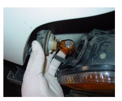
Step 7: Twist off the corner light from the headlight.