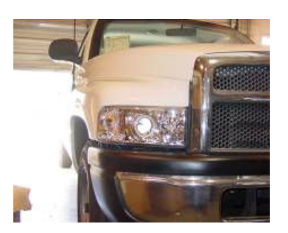
Step 15: Bolt on the headlight and check all functions before driving.