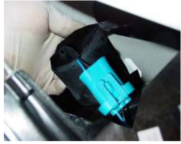
Step 13: Plug the headlight wire harness into the original headlight harness.