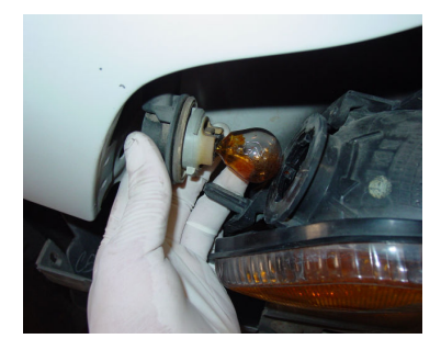
Step 14: Plug in the corner light.