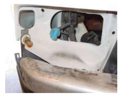
Step 9: Remove the headlight from the car.