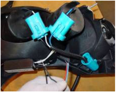
Step 11: Connect the red and blue wires together and black with black for halos and led.