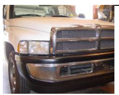
Tools needed. 10mm socket, flat head screwdriver, wire splicer, electrical tape.

Read complete instructions before installation! Improper installation may void warranty