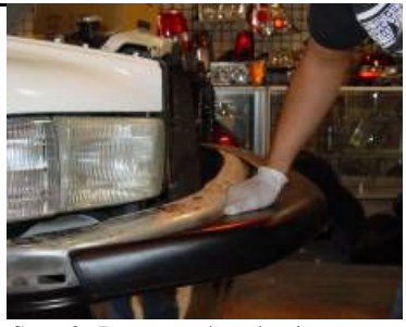
Step 2: Remove the plastic bumper guard with the flat head screwdriver for the clips inside the metal bumper.