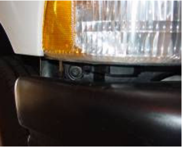
Step 5: Remove the second 10mm screw under the corner light.