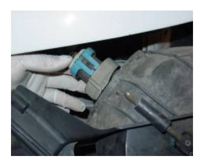
Step 8: Twist off the headlight bulb from the housing.