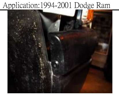
Step 1: Use the flat head screwdriver to remove the pin holding in the place bumper