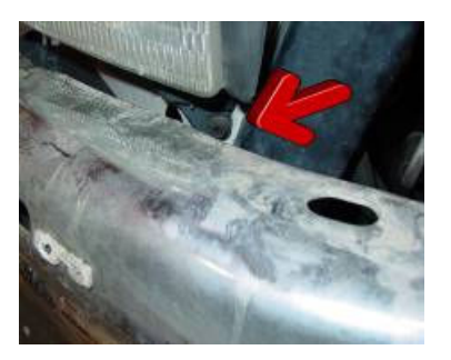
Step 6: Remove the third screw from the bottom headlight.