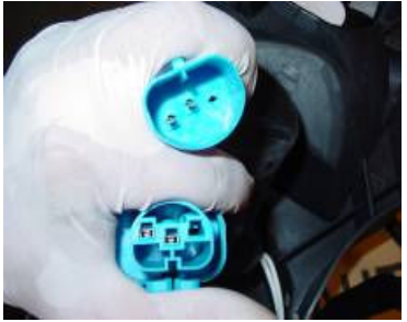
Step 10: Plug the supplied 2 to 1 wire harness into the new Anzo head light.