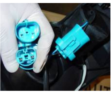
Connect the high beam and low beam plugs, check connectors for proper install.