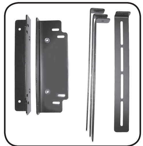
Brackets included with this kit