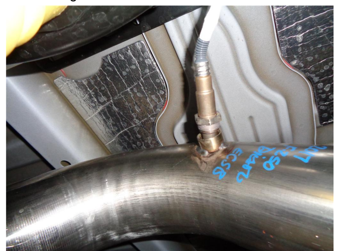
Step 6. Reattach the O2 sensor (6.7L only).