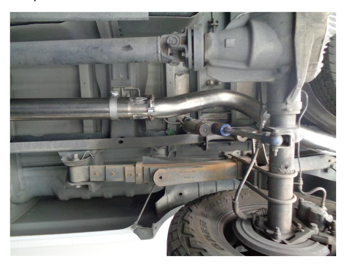
Step 4. Loosely install the Over Axle Pipe Assembly using the supplied clamp. Remove the sensor plug for 6.7L application. Loosely slip the Hanger Clamp Assembly over the pipe and locate the welded hangers to the rubber insulators.