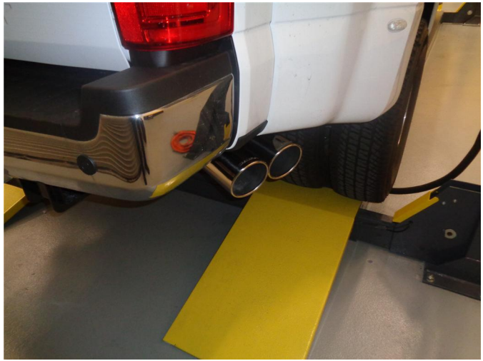
Step 7. Once a final position has been chosen for the new exhaust system, evenly tighten all clamps from front to rear using the torque specifications on page one of the instructions. Inspect all fasteners after 25-50 miles of operation and re-tighten if necessary.