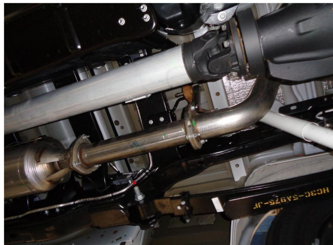
Step 1. To remove the OEM exhaust remove the O2 sensor from the over axle pipe (6.7L only). Unbolt the extension pipe assembly from from the DPF outlet flange (6.7L) or loosen the band clamp attaching the inlet pipe (6.4L). Working front to rear disengage all welded hangers from the rubber insulators. Be sure to retain all mounting hardware as it will be needed to install your new MAGNAFLOW system.