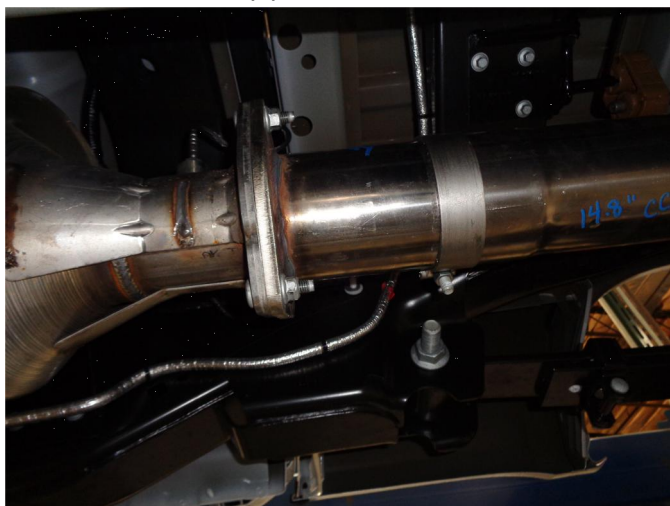
Step 3. Begin installation by loosely attaching the Inlet Pipe Assembly to the OEM flange outlet using the OEM hardware (6.7L), or loosely attach the Inlet Adapter to the DPF outlet using the supplied clamp (6.4L). Loosely attach the Extension Pipe, if needed, using the supplied clamp.