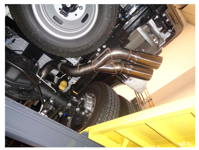
Step 5. Loosely slip the Hanger Clamp Assembly over the Tail Pipe Assembly. Loosely install the Tail Pipe Assembly using the supplied clamp. Engage the welded hanger to the rubber insulator.