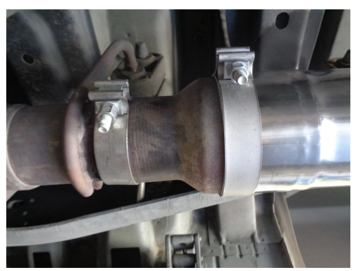
Step 3. Begin installation by loosely attaching the Inlet Pipe Assembly to the OEM flange outlet using the OEM hardware (6.7L), or loosely attach the Inlet Adapter to the DPF outlet using the supplied clamp (6.4L). Loosely attach the Extension Pipe, if needed, using the supplied clamp.

Step 2. Determine the overall length of the Inlet Pipe Assembly and the Extension Pipe, if required using the chart. The measurements are what needs to be cut from the outlet end of the pipes.