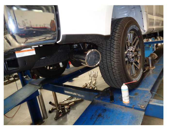
Step 7. Once a final position has been chosen for the new exhaust system, evenly tighten all clamps from front to rear using the torque specifications on page one of the instructions. Inspect all fasteners after 25-50 miles of operation and re-tighten if necessary.