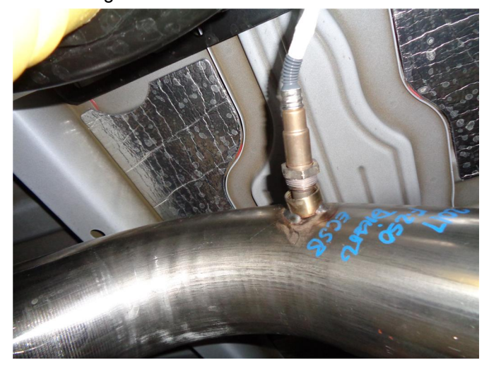
Step 6. Reattach the O2 sensor (6.7L only).