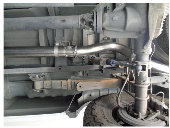
Step 4. Loosely install the Over Axle Pipe Assembly using the supplied clamp. Remove the sensor plug for 6.7L application. Loosely slip the Hanger Clamp Assembly over the pipe and locate the welded hangers to the rubber insulators.