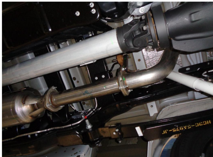
Step 1. To remove the OEM exhaust remove the O2 sensor from the over axle pipe (6.7L only). Unbolt the extension pipe assembly from from the DPF outlet flange (6.7L) or loosen the band clamp attaching the inlet pipe (6.4L). Working front to rear disengage all welded hangers from the rubber insulators. Be sure to retain all mounting hardware as it will be needed to install your new MAGNAFLOW system.