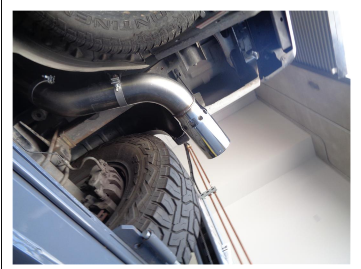
Step 5. Loosely slip the Hanger Clamp Assembly over the Tail Pipe Assembly. Loosely install the Tail Pipe Assembly using the supplied clamp. Engage the welded hanger to the rubber insulator.