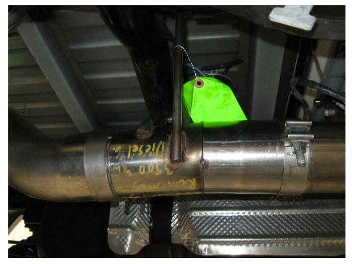
Step 5. The shorter Inlet Pipe [Item 1] will be needed for all 2013 and later Mega Cab applications only.

MAGNAFLOW: 1901 Corporate Centre Drive - Oceanside, CA 92056 | 1(800) 990-0905 Technical Support: 1(800) 959-9226 | Email: moreinfo@magnaflow.com