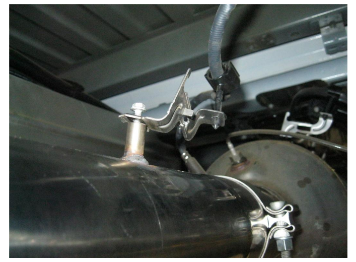
Step 4. For year spread 2013 and later with a long bed configuration attach the OEM cable bracket using the OEM bolt. This step is not required on other years or configurations.

Step 3. Begin installation of the Magnaflow system by clamping the Inlet Pipe or Over Axle Pipe (depending on vehicle configuration) to the outlet of the DPF using a supplied 4.00" clamp. Locate the alignment notch to the OEM outlet. Slide the Hanger Clamp Assembly over the pipe and locate the welded hangers in the rubber insulators (leave all clamps loose for final adjustment of the complete system).