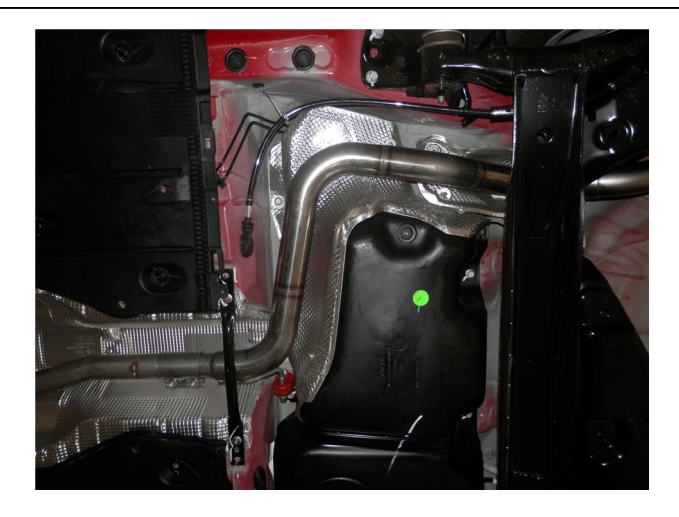
Step 2. Begin installation of the new system by attaching the Inlet Pipe to the factory outlet using the OEM clamp and fit the hangers into the rubber insulators. Leave all clamps loose until final adjustment.

Step 1. It is necessary to cut the OEM exhaust to ease removal from the vehicle. Locate a spot that has easy access just in front of the rear wheel suspension assembly. Once cut, undo the slip on clamp located behind the exhaust valve assembly and extract the hanger located in the rubber insulator and remove the front portion of the OEM exhaust. Next, remove the hangers supporting the muffler assembly and remove it from the vehicle. Do not damage or discard the rubber insulators or OEM clamp as they will be re-used to mount the new system.