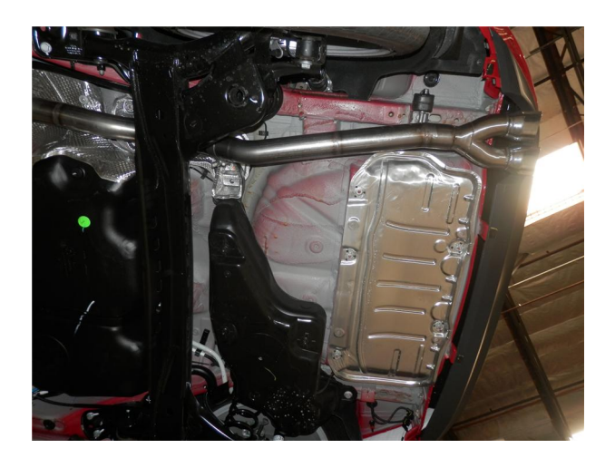
Step 3. Next Install the Tailpipe Assembly using the supplied 2.50" clamp and fit the welded hanger into the rubber insulator.

MAGNAFLOW: 22961 Arroyo Vista - Rancho Santa Margarita, CA 92688 | 1(800) 990-0905 Technical Support: 1(800) 959-9226 | Email: moreinfo@magnaflow.com