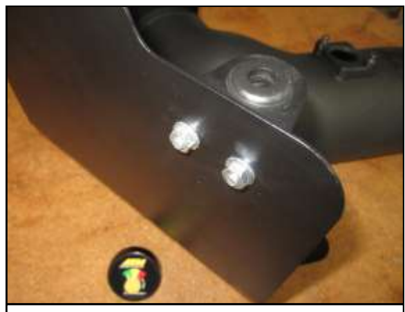
E. View of the M6 nuts (U) on the outside of the heat shield to mount the bracket.