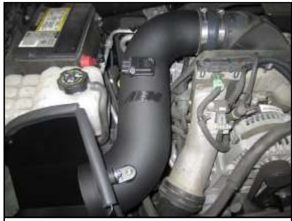
K. Install your AEM<sup>®</sup> Cold Air Intake tube (A), first into the heat shield opening and then into engine inlet hose as shown. Do not tighten the inlet hose clamp yet.