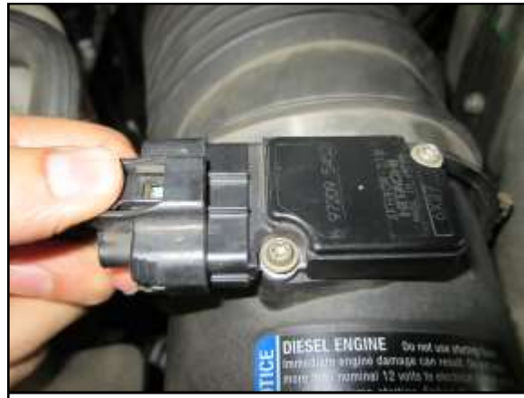
B. Depress the snap tab on the MAF sensor connector as shown and pull it to disconnect the harness from the sensor.