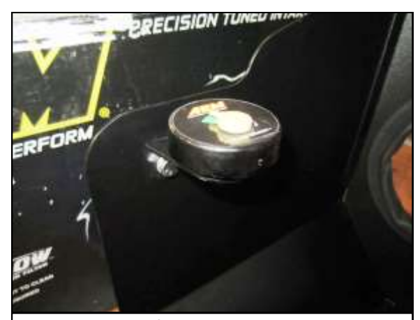
F. Install the AEM<sup>®</sup> Filter Minder™ Gauge (N) into the mounting grommet as shown. Use glass cleaner or silicone spray lubricant to lubricate the grommet and completely seat the gauge.