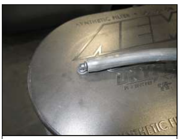
P. Install the small grommet (Q) into the ½" hole, and then install the 5/32" plastic elbow port (W) into the grommet. Finally install the 5/32" hose (M) onto the elbow port as shown.