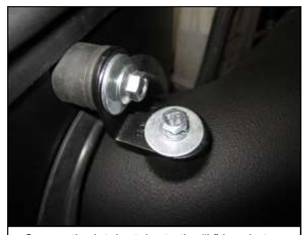
L. Secure the intake tube to the "L" bracket using one M6 x 16MM bolt (T), one split washer (V), and one flat washer (X) as shown and tighten the bolt.