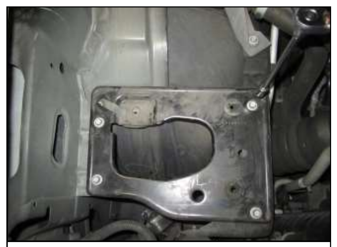
E. Using a 10mm socket remove the 4 bolts retaining the stock air box mounting plate, and then remove the mounting plate. Do not discard these parts.