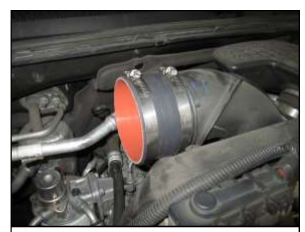
B. Install the silicone hose (C) onto the engine air inlet using a #72 hose clamp (I). Fully tighten that hose clamp and then loosely install another hose clamp (I) onto the open end of the hose.