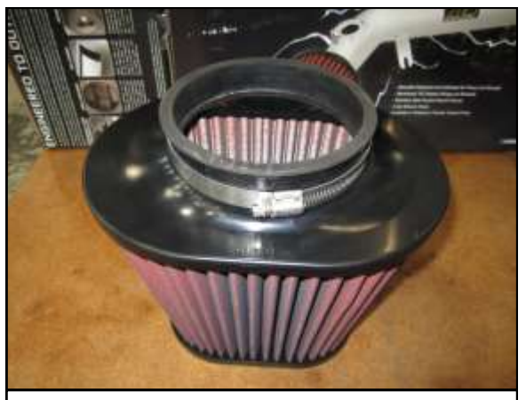
Q. Install the large hose clamp (J) over the filter outlet, and then insert the larger 5-2279 filter base adapter (E) into the outlet of your new AEM® Dryflow™ Air Filter. Do not use the smaller base adapter included in the filter kit.