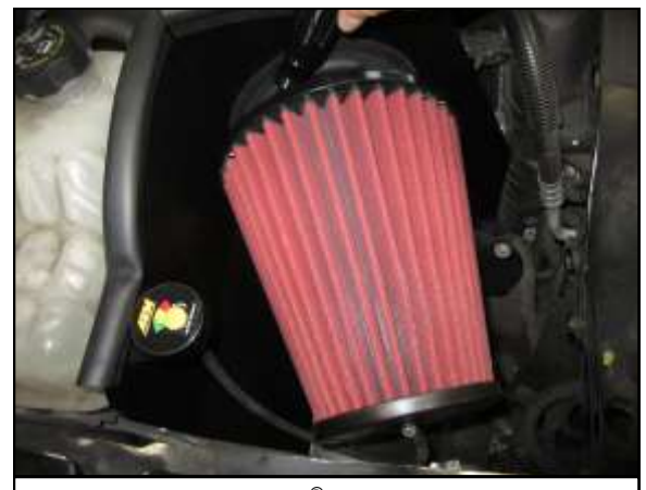
R. Install your new AEM<sup>®</sup> Dryflow<sup>™</sup> Air Filter assembly onto the inlet of the intake tube inside the heat shield. Align the filter as shown and tighten the large hose clamp (J) at the filter base.