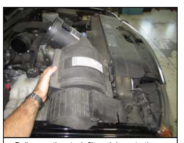
D. Pull up on the stock filter air box starting on the side closer to the engine to "pop" it free from the 3 mounting grommets. Remove the air box assembly from the engine bay.