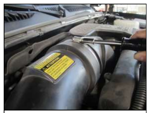
C. Loosen the two hose clamps retaining the stock intake tube at both ends and remove the tube from the engine bay.