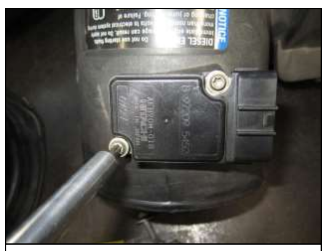
F. Using a T20 Torx bit, remove the 2 screws retaining the MAF sensor to the upper air box and remove the sensor for use with your new AEM<sup>®</sup> Cold Air Intake. Make sure the O-ring is intact on the sensor.