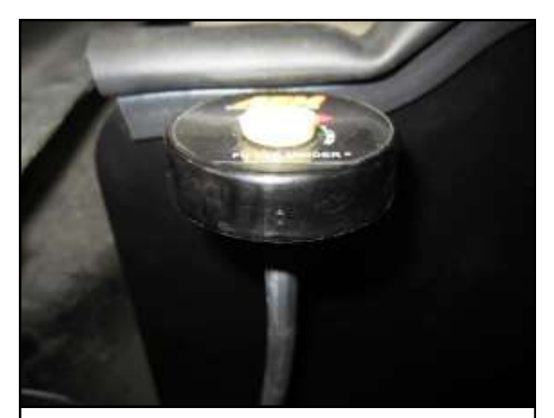
S. Connect the 5/32" air hose to the port underneath the AEM<sup>®</sup> Filter Minder™ Gauge as shown.