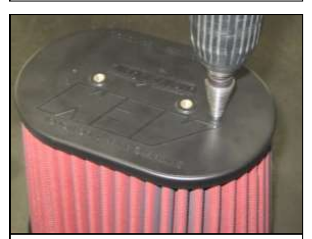
O. Port Installation for AEM<sup>®</sup> Filter Minder™ Gauge: Drill a ¼" hole in the plastic cap of your AEM-21-2258DK Dryflow™ Air Filter (D) at the dimpled location. Clean out all plastic shavings from inside the filter.