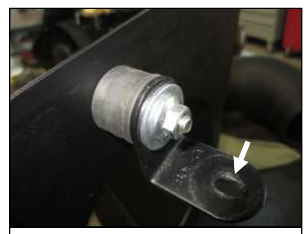
H. Install the "L" mounting bracket (R) onto the end of the rubber isolator mount using another flat washer (X) and M6 nut. (U). Note that the slotted hole in the bracket is facing down. Leave the M6 nut loose for Step M.