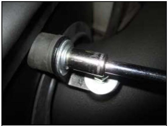
M. Now tighten the upper M6 nut to secure the "L" bracket to the rubber mount.