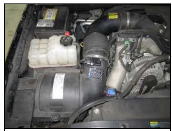
A. Open vehicle hood. Stock intake system shown.