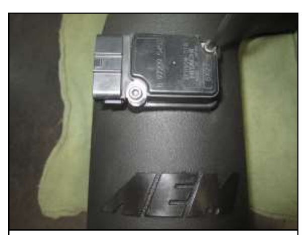
A. Install the factory MAF sensor onto the mounting pad of your AEM<sup>®</sup> Cold Air Intake tube (A) using the two M4 Allen bolts provided. Tighten the bolts with a 3mm Allen key.

a. When installing the intake system, do not completely tighten the hose clamps or mounting hardware until instructed to do so.