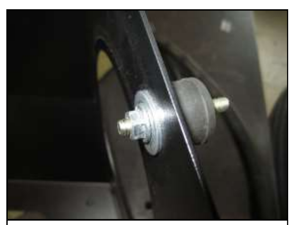
G. Install the M6 rubber isolator mount (K) into the hole over the large opening in the heat shield (B), then install one flat washer (X) and one M6 nut (U) on the inside of the heat shield as shown. Tighten the nut.