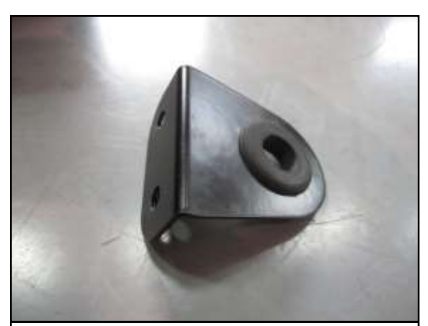
C. Install the grommet (O) into the AEM<sup>®</sup> Filter Minder<sup>™</sup> support bracket (P) as shown.