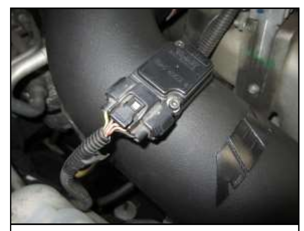
T. Re-connect the MAF harness to the MAF sensor as shown.