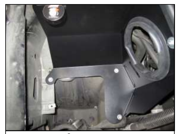
J. Install the AEM<sup>®</sup> heat shield into the engine bay using 3 of the stock M6 bolts with washers from the stock mounting plate as shown and tighten the bolts.