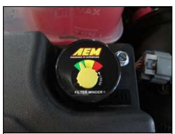
U. Make sure the AEM<sup>®</sup> Filter Minder™ Gauge needle is pointing to the GREEN sector. When your AEM<sup>®</sup> Dryflow™ Air Filter is too dirty, it will point to the RED sector. This will mean it is time to wash your Dryflow™ Filter. See the next page for details.