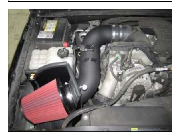
V. AEM-21-9034 Cold Air Intake installed.