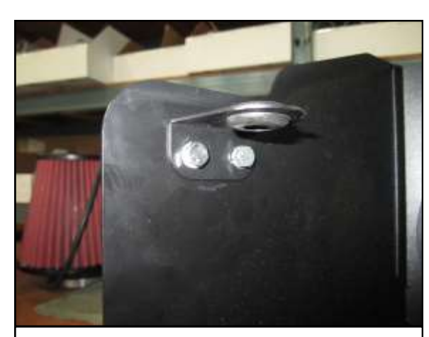
D. Mount the Filter Minder™ bracket onto the inside of the AEM<sup>®</sup> heat shield (B) using 2 M6 hex bolts (S), 2 split washers (V), and 2 M6 nuts (U) as shown and fully tighten them.