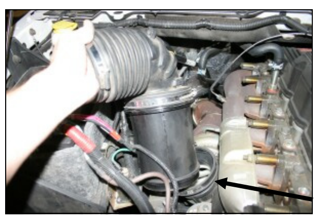
3. Loosen the hose clamp that secures the factory intake tube assembly to the rubber elbow on the turbo inlet, and remove the assembly from the vehicle.