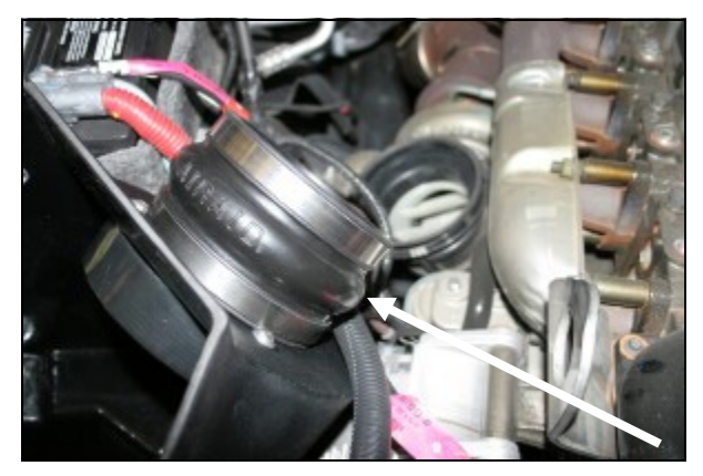
10. Install the supplied hump hose (#5) onto the filter adapter using two #72 hose clamps. Leave the clamps loose for now.