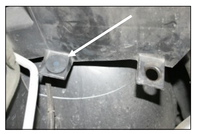
7. Install the supplied well nut into the factory airbox mounting hole closest to the fender as shown.

4. Remove the two grommets that held the factory airbox in position.