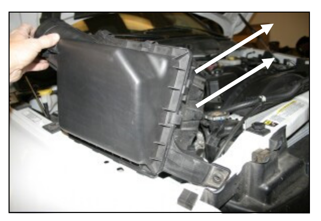
2. Slide the flexible intake tube off of the factory airbox lid and then rock the factory airbox assembly side to side to release it from the mounting grommets, and remove it from the vehicle.