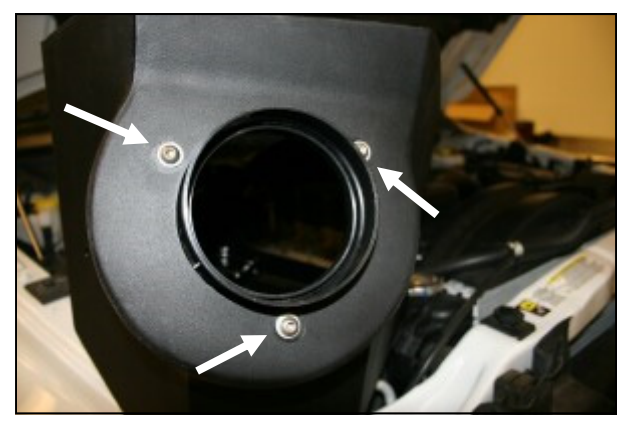
8. Install the filter adapter into the Cool Air Box using three 1/4" Button Head bolts and flat washers as shown.

5. Using a 13mm socket remove one bolt that secures the fan shroud to the radiator on the passenger side of the vehicle.