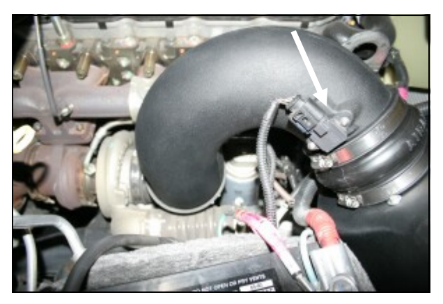
11. Install the Airaid Intake Tube (#2) into the factory turbo elbow and then into the hump hose. Adjust for fit, and then tighten all three hose clamps. Reinstall the intake temperature sensor into the Airaid Intake Tube using two 8-32 button head screws (#7) and #8 flat washers (#8). Do Not Use The Factory Screws!