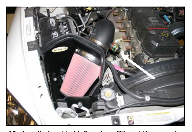
12. Install the Airaid Premium Filter (#1) onto the filter adapter and tighten the clamp. Install the weatherstrip onto the top of the CAB starting at the right fender and working your way towards the radiator. Next reinstall the factory filter minder and grommet into the Airaid Intake Tube. Apply the Airaid Decal as shown.