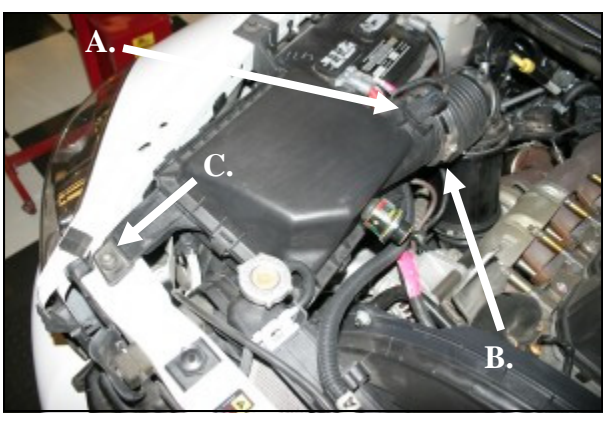
1. Disconnect the negative battery cables. A.) Using the provided T-20 torx bit, remove the two temperature sensor mounting bolts and the sensor from the factory intake tube (set aside for reuse). B .) Loosen the hose clamp where the flexible tube connects to the factory airbox lid. C.) Using a 10mm socket, remove the nut that secures the factory airbox to the radiator mount.

Full color instructions can be viewed on our web site at Airaid.com. If you need any assistance please call 1-800-858-3333 to speak with a representative in our Customer Service Center before returning the product.