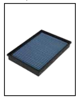
P/N: 30-10269 (P5R) 31-10269 (PDS)

To purchase any of the items above, view airflow charts, dyno graphs, photos, and video; please go to aFepower.com.