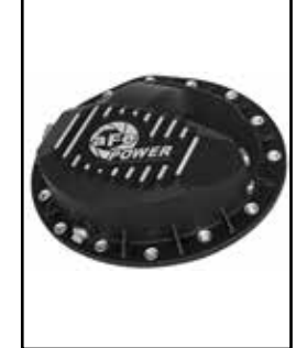
P/N: 46-70362 (Blk./Mach.) 46-70360 (RAW)