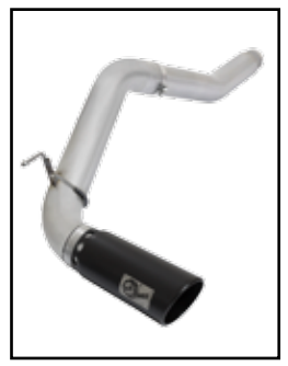
P/N: 49-06112-B (Blk Tip) 49-06112-P (Pol Tip)