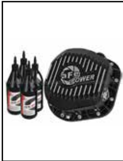
Rear Differential Cover

P/N: 46-70022-WL (w/ Oil) 46-70022 (Black) 46-70020 (RAW)