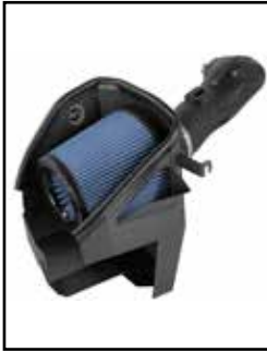
Stage-2 Air Intake System