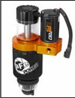
DFS Fuel System

P/N: 42-13041 (Full-Time) 42-13042 (Part-Time)