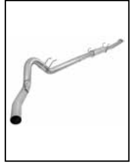
DP-Back Exhaust System

P/N: 49-03039 (w/ Muffler) 49-03039NM (No Muffler)