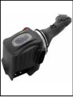
Momentum Intake System