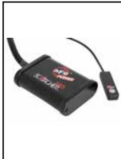
SCORCHER HD Module

P/N: 42-13041 (Full-Time) 42-13042 (Part-Time)