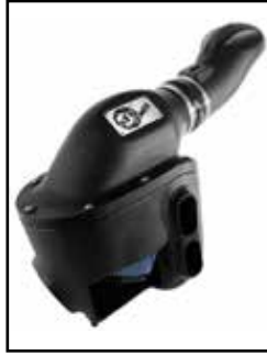
Stage-2 Si Intake System