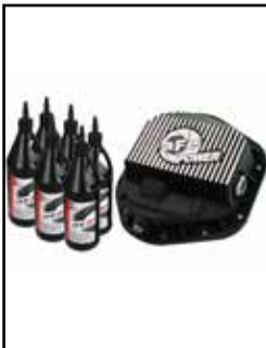
Front Differential Cover

P/N: 46-70082-WL (w/ Oil) 46-70082 (Black) 46-70080 (RAW)