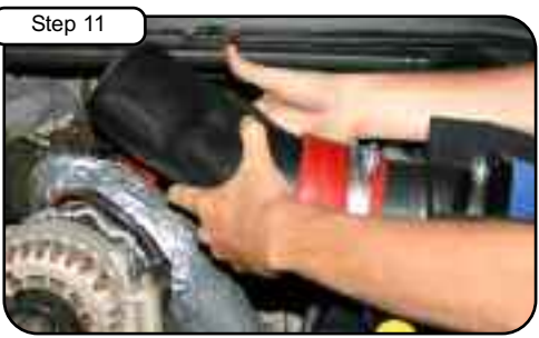
Slide coupler and clamps on tube. Position assembly into the intake kit.