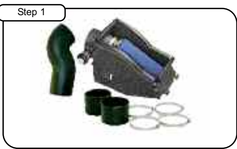
Complete kit components