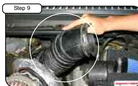
Loosen the hose clamps on turbo side. Remove intake duct out of the engine bay.