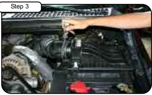
Remove the upper portion of the air box by loosening the hose clamp on the air box. Carefully remove the air filter minder on the side of the air box.