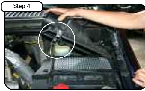
Loosen the air box lid clamps and remove air box lid and OEM air filter.