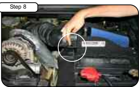
Insert the 1.5" hose into the nipple on the side of the housing. The filter minder will be placed here.