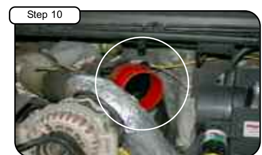
Place the coupler and clamps over the turbo inlet. Do not tighten the clamps at this time.