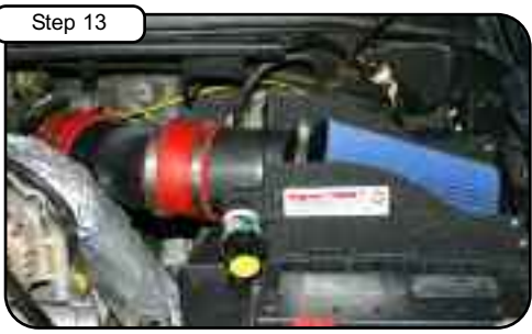
Your aFe intake installation is now complete. Make sure all clamps are tight and that all electrical components are secure. Check and tighten connections after a few hours of operation. Thank you for choosing aFePower!

Place enclosed CARB EO sticker on a clean/smooth surface on or near the intake system. EO identification label is required in passing the Smog Check inspection.