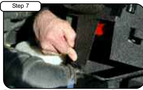
Depress spring tab slightly and lower the filter housing down into OE housing until the spring tab snaps into place.