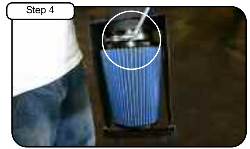
Place the new air filter inside the new housing and tighten the clamp. Next attach the front splash guard to the front of the housing. Secure with the provided screws.