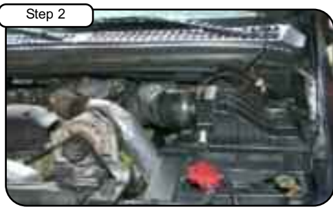
Complete Stock Intake. Disconnect battery before install.