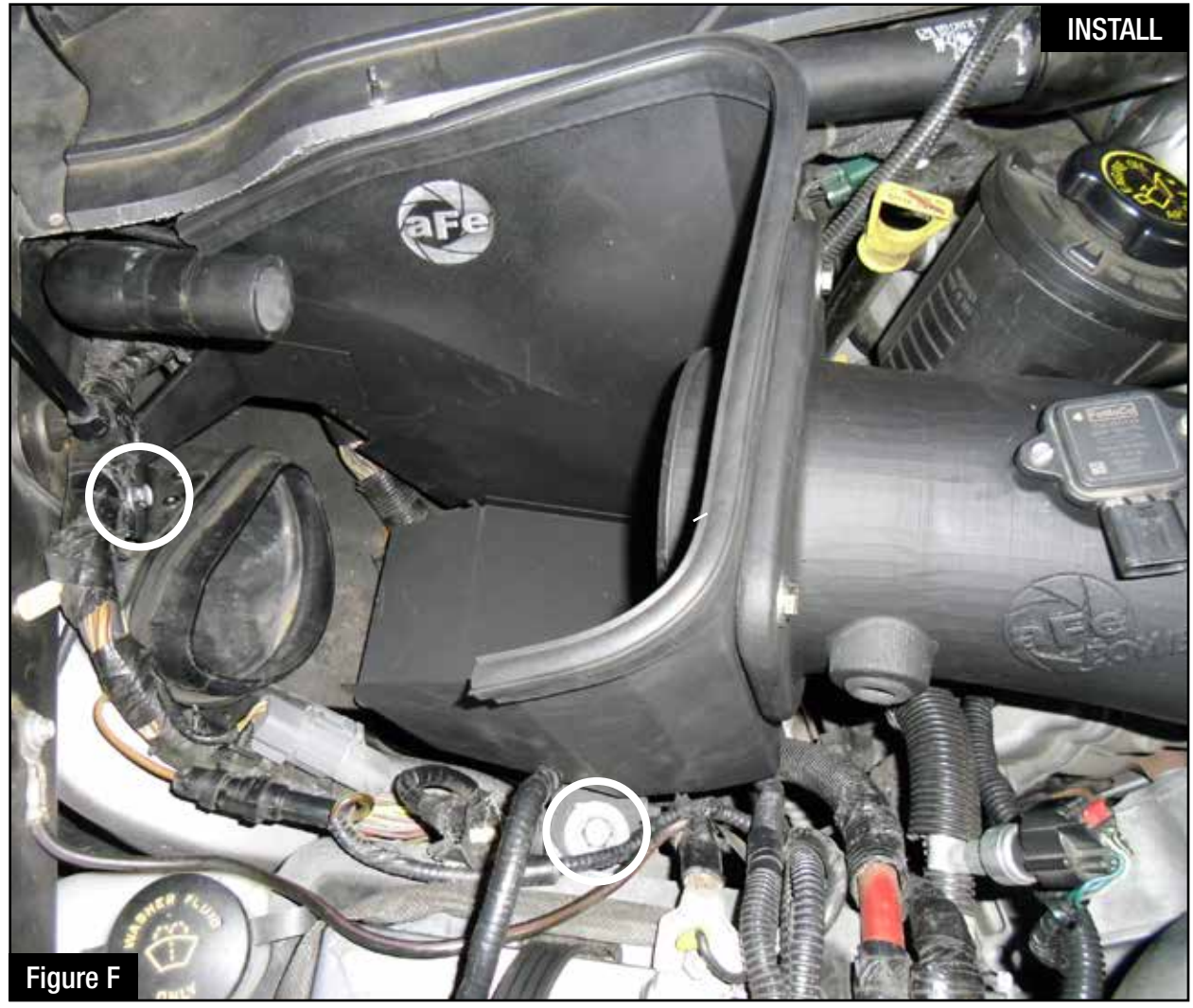
Refer to Figure F for step 16

Step 16. Unbolt 13 mm factory screws and use them to bolt down the housing. Make sure housing tabs slide over factory bracket.