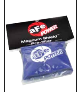
P/N: 28-10041 Yellow P/N: 28-10042 Red P/N: 28-10043 Black P/N: 28-10044 Blue