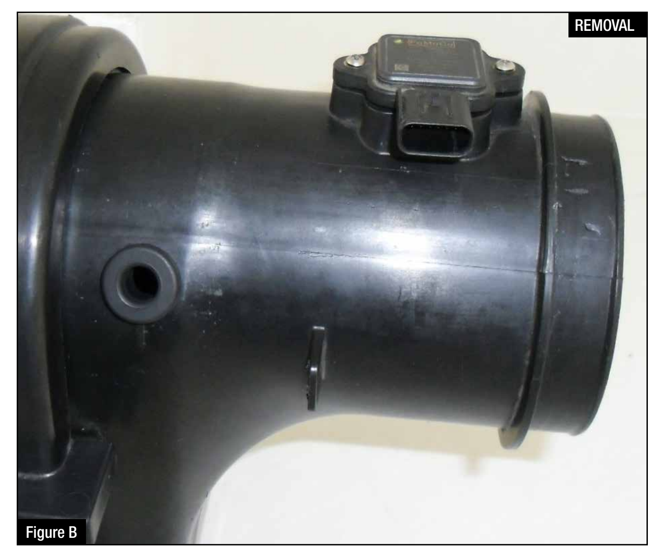
Refer to Figure B for step 6