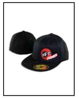
P/N: 40-10114 S/M