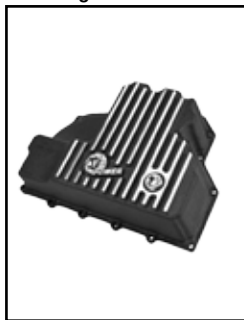
Engine Oil Pan