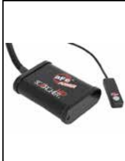
SCORCHER HD Module