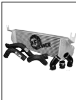
Intercooler w/ Tubes