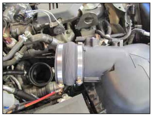
10. Install coupling hose (08695) onto air box assembly. Secure with provided hose clamp.