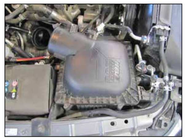
9. Reinstall air box lid onto air box base.

8. Loosen hose clamp securing intake resonator to air box lid and remove intake resonator from lid.