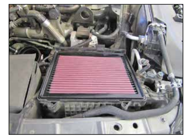
7. Install K&N® filter into air box base.