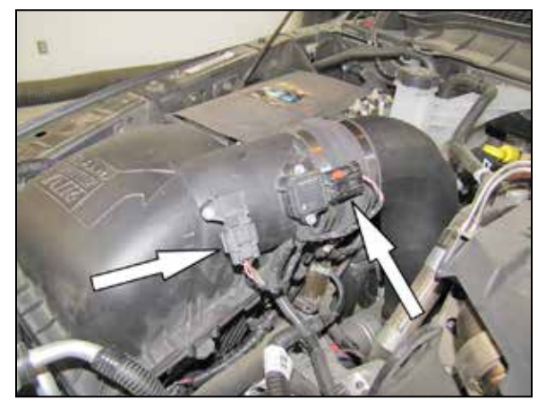
12. Reconnect the mass air sensor and temperature sensor electrical connections.