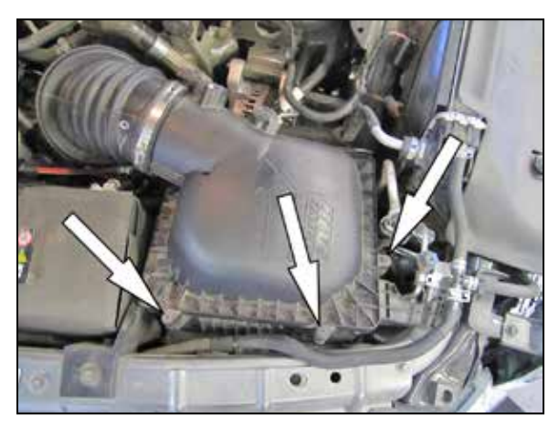
4. Remove the three screws securing air box lid.