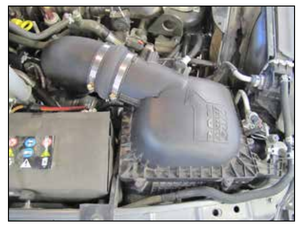
13. Reconnect the vehicle's negative battery cable. Double check to make sure everything is tight and properly positioned before starting the vehicle.

14. It will be necessary for all K&N<sup>®</sup> high flow intake systems to be checked periodically for realignment, clearance and tightening of all connections. Failure to follow the above instructions or proper maintenance may void warranty.