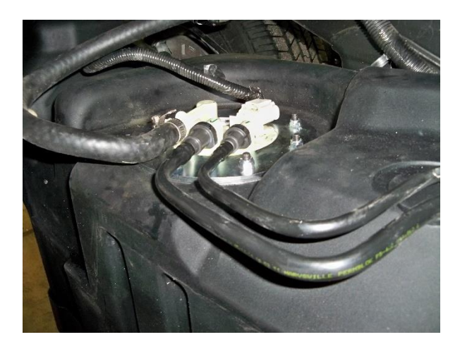
(Fig. 11) Lift tank high enough to reconnect electrical cable and vent hose to sending unit.