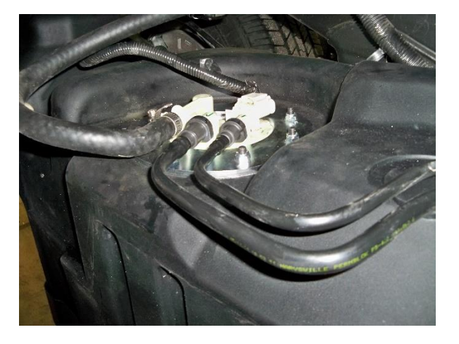
(Fig. 12) Lift tank high enough to reconnect electrical cable and vent hose to sending unit.

(Fig. 11) Angle front of tank up and over round tubular steel cross member.