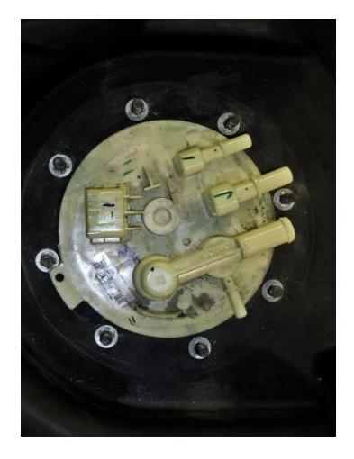
(Fig. 6) Be sure the sending unit is "clocked" nearly the same as in the OEM tank. If the tab was trimmed as in Fig. 5, place the sending unit and rotate it slightly more clockwise until it clears the studs as shown.