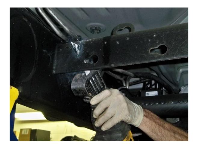
(Fig. 9) Cut jig bracket with saw or grinder.

21 On the frame, located in front of the OEM tank is a jig bracket that is used in fabrication of the vehicle's frame at the plant. It has a "U" shaped weldment at its base against the frame. Two metal fuel lines are attached atop the weldment. The portion of this bracket, just past the edge of the weldment, will need to be cut off to allow installation of the oversized replacement tank. This can be done with a Sawzall, a hand grinder or even a hacksaw. The "U" shaped weldment is left intact to anchor the fuel lines (See Figs. 9 & 10).