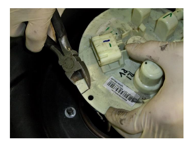
(Fig. 5) If sending unit connections interfere with the mounting studs, trim \frac{1}{2} " off the side of the tab nearest the electrical connector.