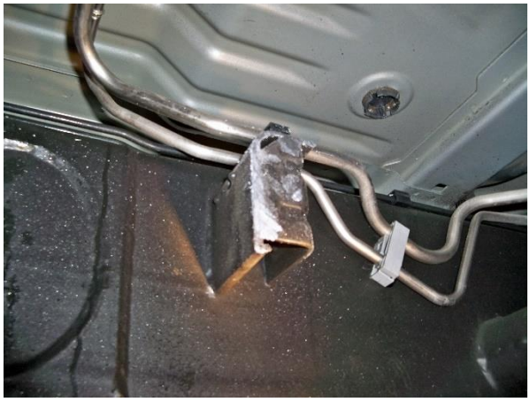
(Fig. 10) Jig bracket shown cut away leaving weldment holding fuel lines.