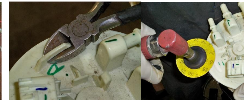
(Fig. 4) If sending unit is equipped with curved ribs on the top, either shave approximately 1/16" off the outside surface of both, or remove the rib closest to the electrical plug using dikes and a hand grinder-sander as shown above so top flange will fit correctly. Be sure surface is perfectly smooth and even to prevent breakage when top flange is tightened.