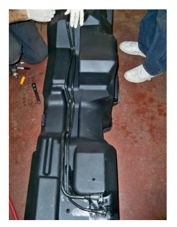
(Fig. 8) Attach the fuel lines to the sending unit and lay them in the retaining groove provided on the top of the replacement tank.

(Fig. 7) Using a torque wrench, tighten the top Flange nuts to 20 ft. lbs. using a "star" pattern.