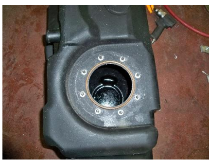
(Fig. 3) Leave the "O" ring gasket, studs and retainers assembled as they are (shown before sending unit, top flange, and 3/8" nylon Locking nuts are installed).

ribs, or by entirely removing the rib closest to the electrical plug with a pair of dikes (diagonal cutters) and hand grinder-sander (See Fig. 4).