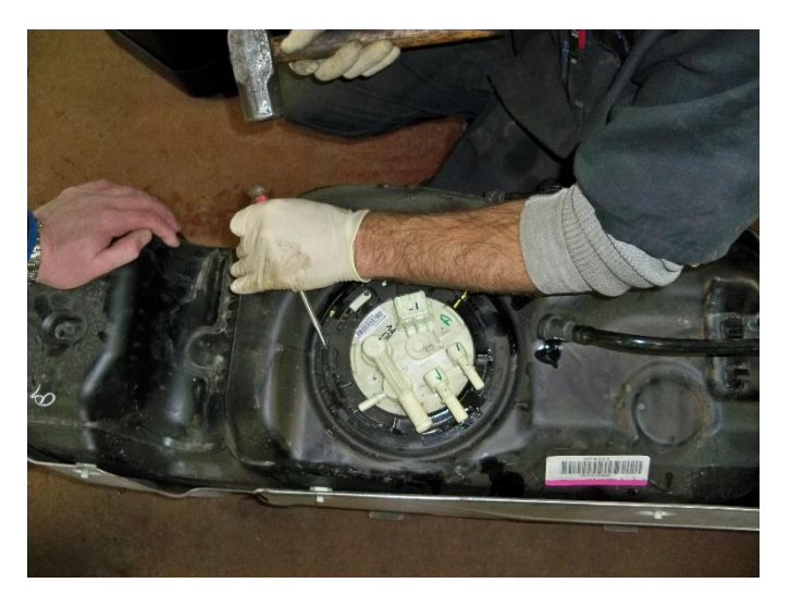
(Fig. 2) Loosen hold-down ring on OEM tank by tapping counter-clockwise, remove and lift out sending unit.