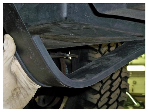
(Fig.13) Extruded bushings installed on straps.

28 Make sure ALL mounting hardware, clamps, bolts, etc. are properly installed and TIGHT. Double check it.