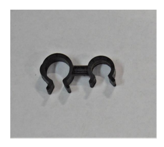
(Fig. 7) Remove the hose clip from the lines leading to the sending unit. Clip shown above.