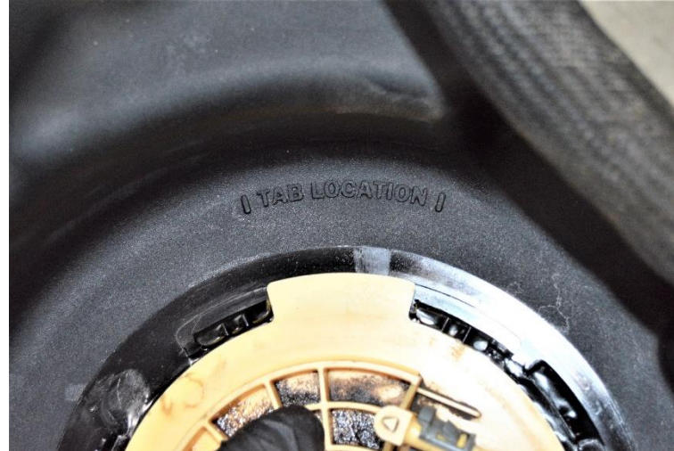
(Fig. 3) O-Ring gasket shown installed correctly.