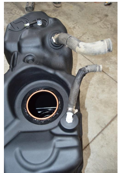
(Fig. 5) Using a hammer and punch, or screwdriver tighten the locking top ring clockwise. The short feed line is shown installed in photo.