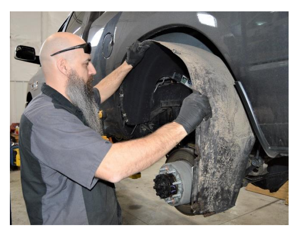
(Fig. 1) Remove driver's side rear wheel and fender liner.