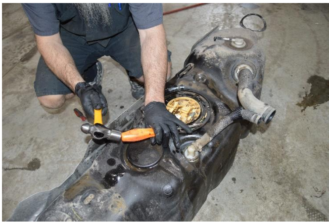
(Fig. 2) Loosen locking top ring on original equipment tank by tapping counter-clockwise, remove and lift out sending unit.