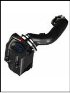
Cold Air Intake System