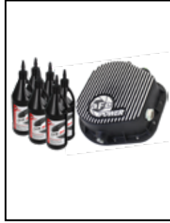
Rear Differential Cover

P/N: 46-70022-WL (w/ Oil) 46-70022 (Blk) 46-70020 (RAW)