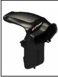
Air Intake System Scoop