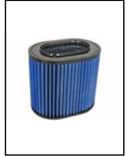
OER Air Filter

P/N: 10-10139 (P5R) 11-10139 (PDS) 71-10139 (PG7)