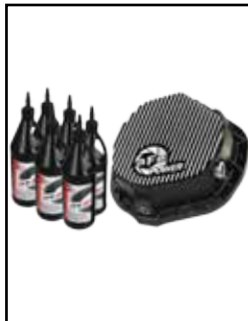
Rear Differential Cover

P/N: 46-70012-WL (w/ Oil) 46-700012 (Blk) 46-70010 (RAW)