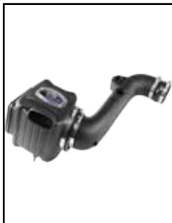
Air Intake System