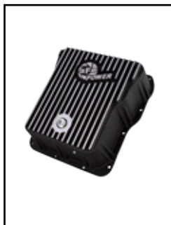
Transmission Pan Cover

P/N: 46-70012-WL (w/ Oil) 46-700012 (Blk) 46-70010 (RAW)