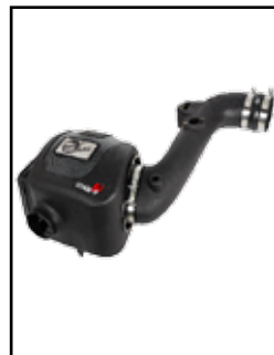
Air Intake System