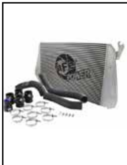
Intercooler w/ Tubes