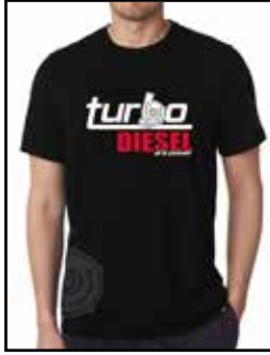
aFe POWER T-Shirt

P/N: 40-30411-B (S) 40-30412-B (M) 40-30413-B (L) 40-30414-B (XL) 40-30415-B (2XL)