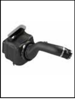
Air Intake System