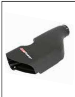
Air Intake Scoop