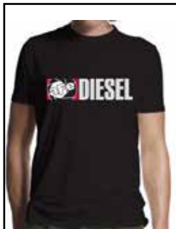
aFe Diesel T-Shirts

P/N: 40-30221 (M) 40-30222 (L) 40-30223 (XL) 40-30224 (2XL) 40-30225 (3XL)