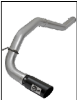
DPF-Back Exhaust System

P/N: 49-46113-B (Blk Tip) 49-46113-P (Pol Tip)