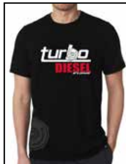
aFe Turbo Diesel T-Shirts

P/N: 40-30411-B (S) 40-30412-B (M) 40-30413-B (L) 40-30414-B (XL) 40-30415-B (2XL)