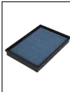
OE Replacement Filter

P/N: 30-10269 (P5R) 31-10269 (PDS) 73-10269 (PG7)