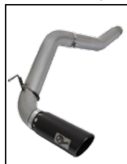
DPF-Back Exhaust System

P/N: 49-46112-B (Blk Tip) 49-46112-P (Pol Tip)