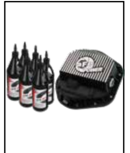
P/N: 46-70082-WL (w/ 0il) 46-70082 (Blk) 46-70080 (RAW)