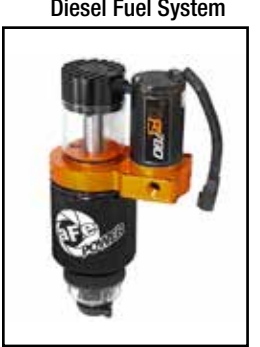
P/N: 42-13031 (Full-time) 42-13032 (Part-time)