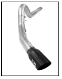
P/N: 49-03054-P (Pol) 49-03054-B (Blk) Exhaust Race Pipe