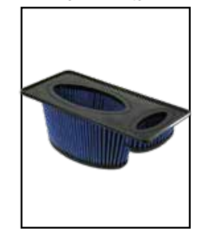
P/N: 10-10107 (P5R) 11-10107 (PDS) 71-10107 (PG7)