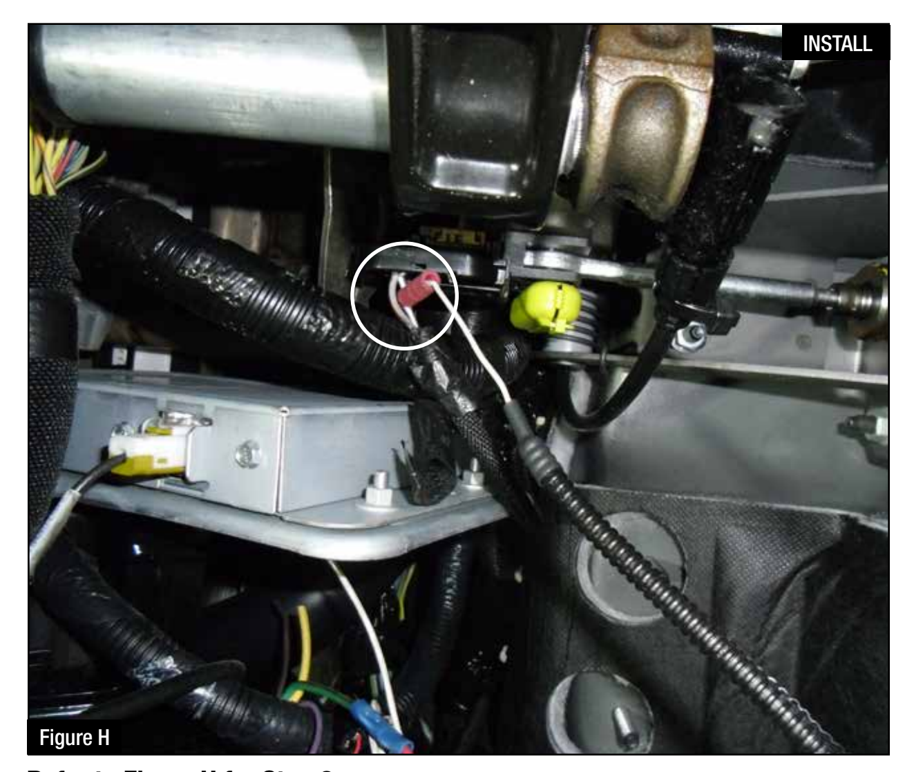
Refer to Figure H for Step 8.