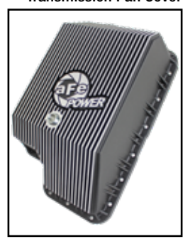
P/N: 46-70122 (Blk) 46-70120 (RAW)