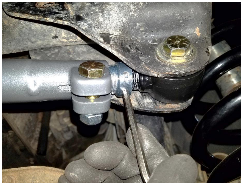
Figure 12. Turning the Adjuster Sleeve.