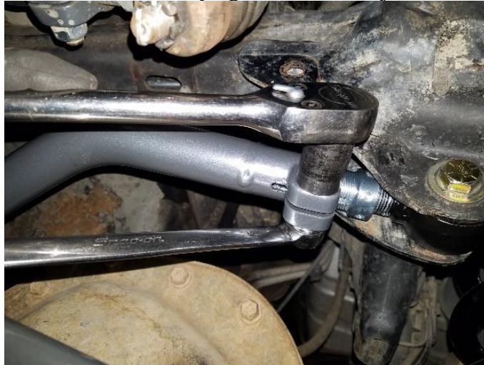
Figure 13. Tightening Pinch Bolt.