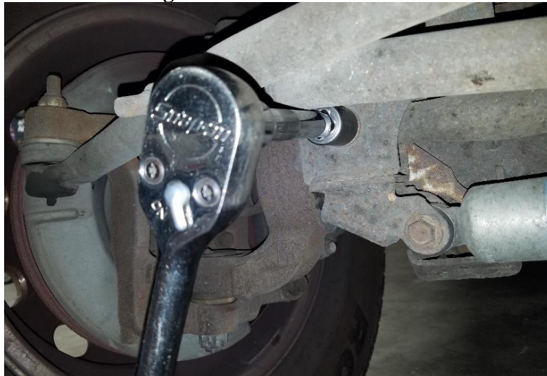
Figure 2. Unbolting the Axle Side of the Front Track Bar