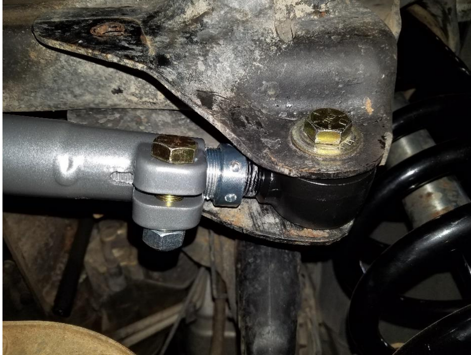
Figure 6. Installing the Frame Side Bolt