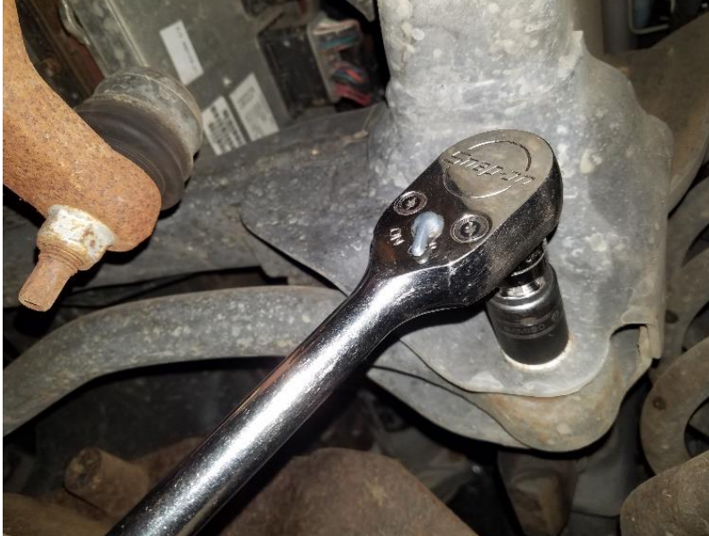
Figure 3. Unbolting the Frame Side of the Front Track Bar