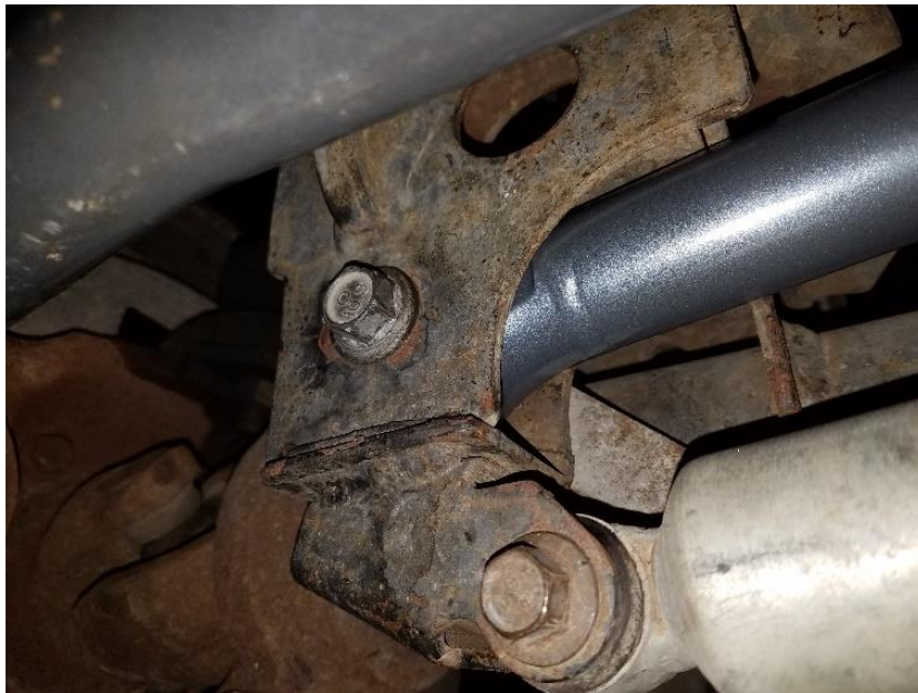
Figure 4. Installing the Axle End Bolt