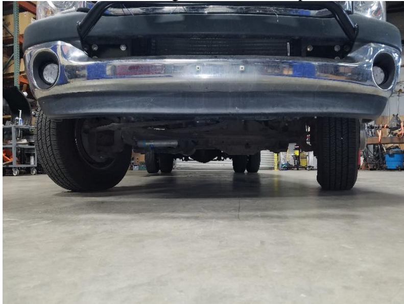
Figure 1. Wheels Turned to the Passenger Side.