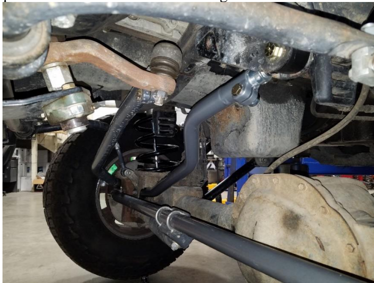
Figure 14. Completed Installation