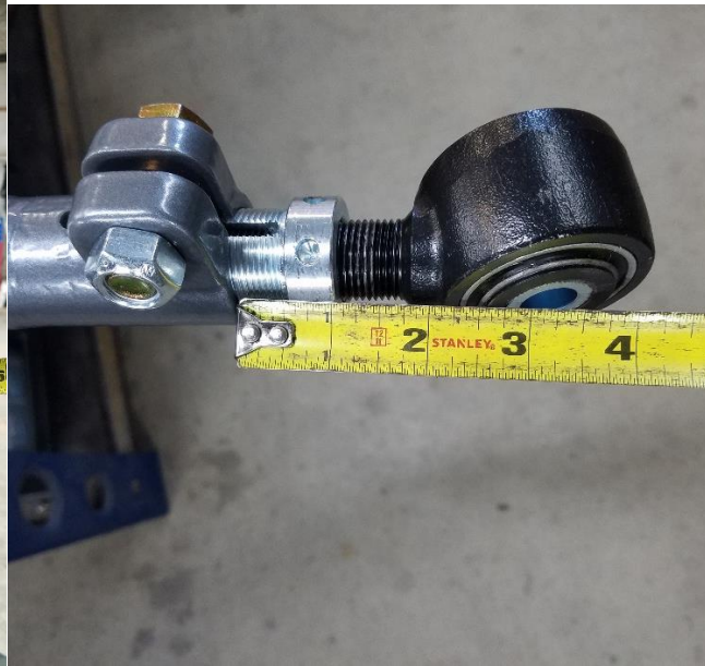
Figure 11. Max Angled DDB Forging Stick Out