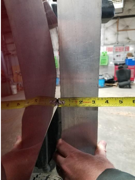
Figure 10. Measuring Axle Side to Side