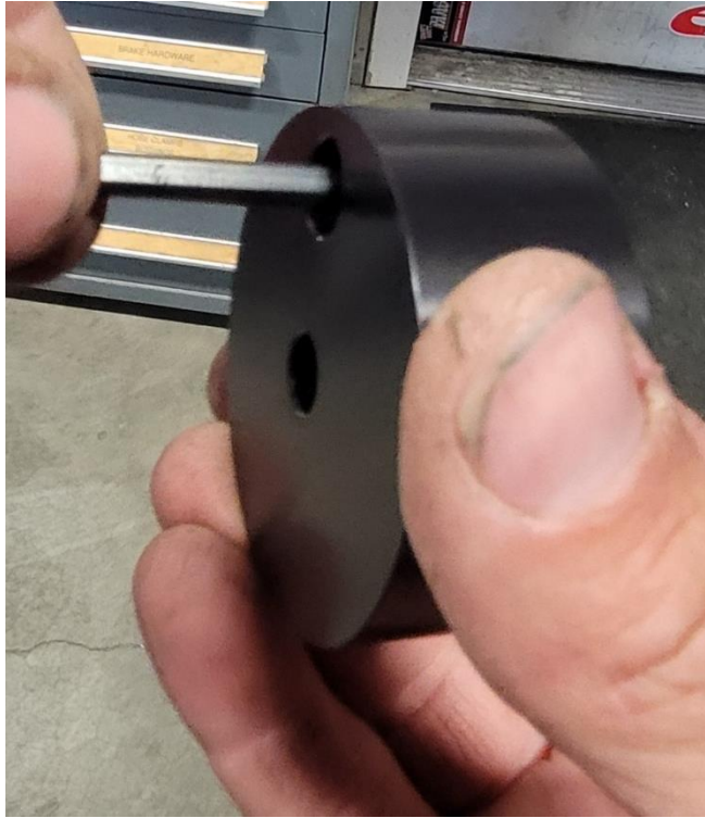
Figure 3. Installing the Socket Head Cap Screw.