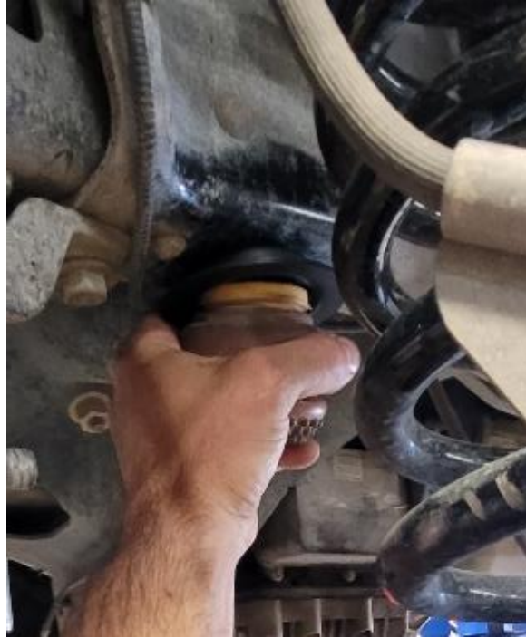
Figure 1. Removing the Factory Snubber.