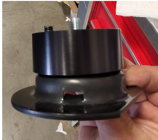
Figure 4. Spacer and Cup aligned for installation.