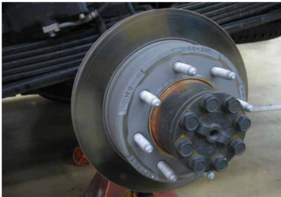
Remove the banjo bolt and the 14mm mounting bolts and remove the stock brake caliper and cradle bracket