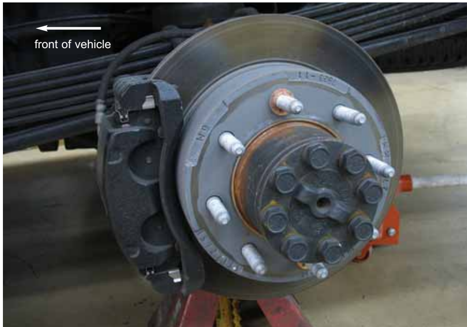
Stock rear brakes shown