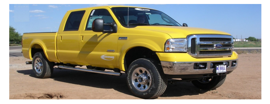
Daystar® Lifetime GoEverywhere Limited Warranty

Your Daystar® Comfort Ride or Budget Boost leveling kit is covered by the following Go Everywhere Lifetime Limited Warranty provided exclusively