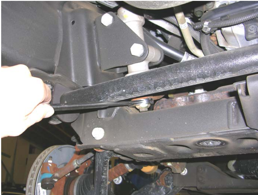
Figure 3: idler arm