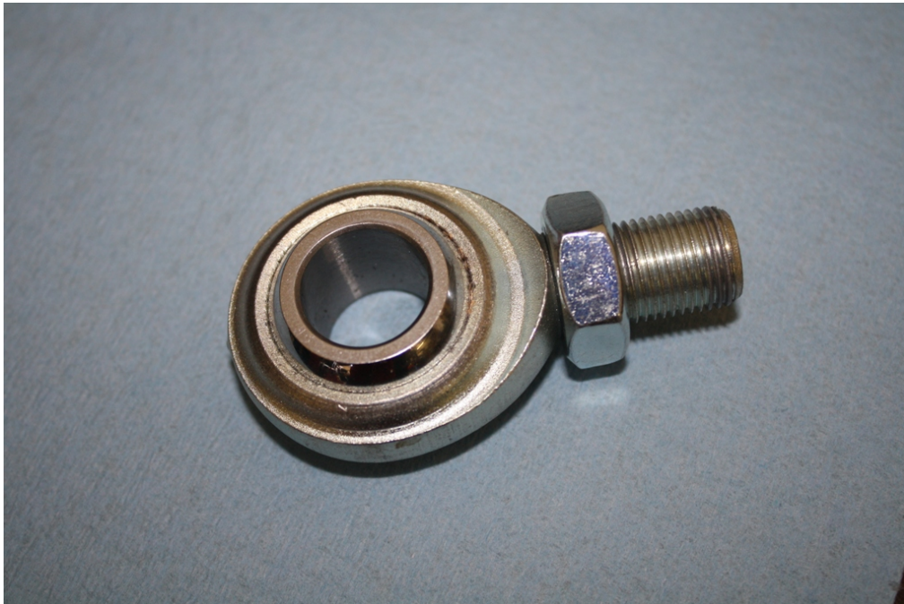
Figure 1: thread first jam nut ALL THE WAY UP on the joint