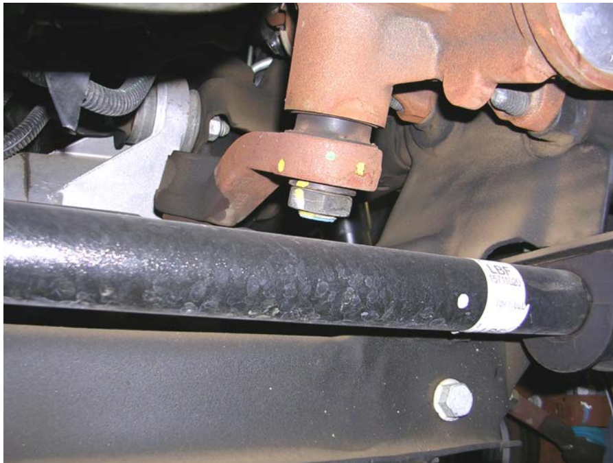
Figure 5: pitman arm