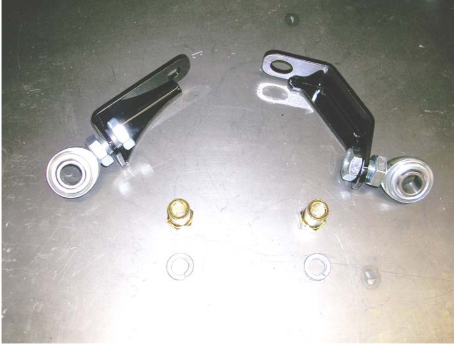
Figure 2: idler arm bracket on left, pitman arm bracket on right